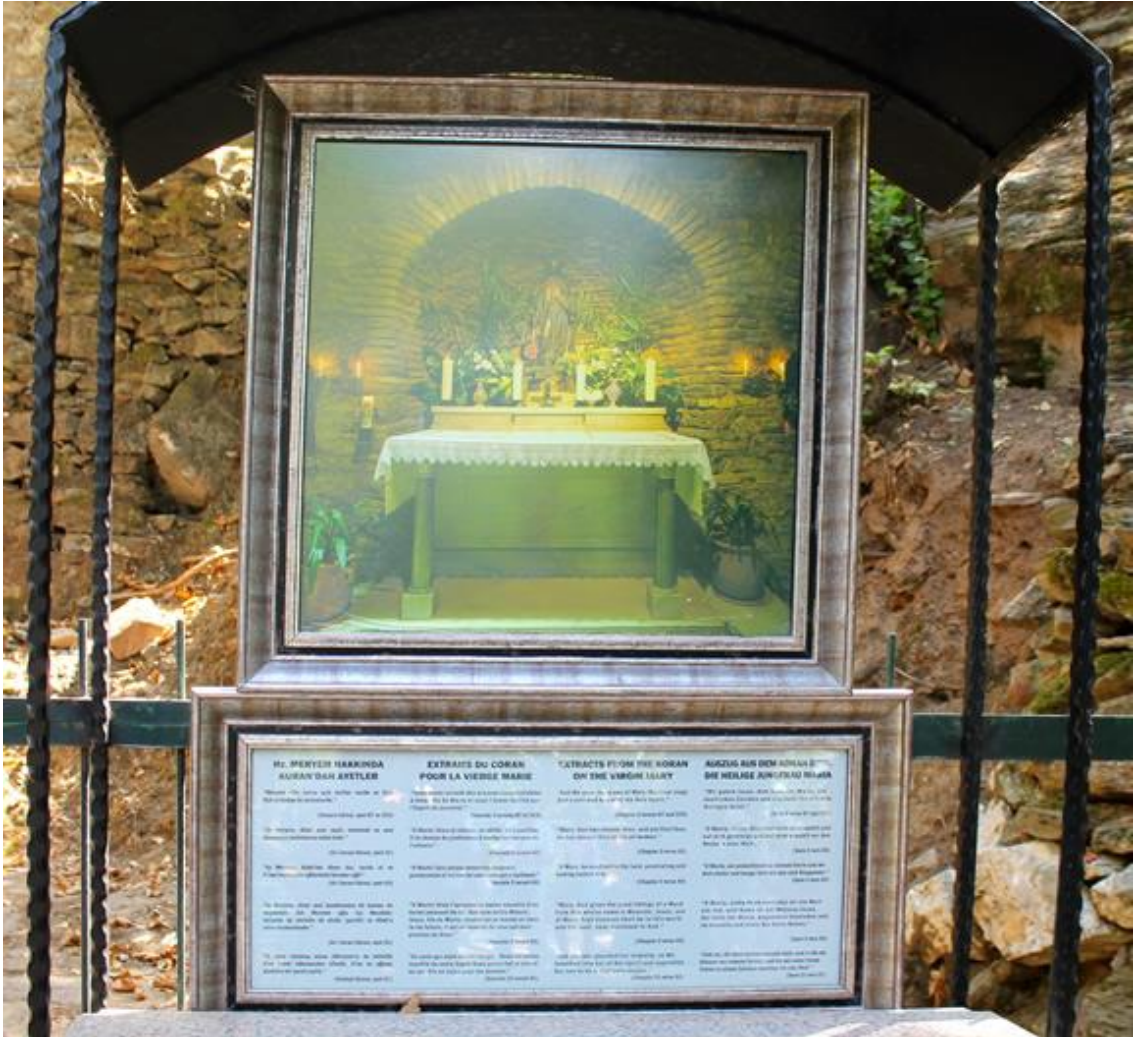
Figure 5.8. Display of Quranic verses, House of the Virgin Mary, Turkey.