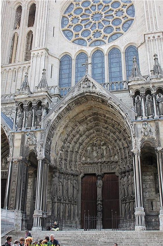
Figure 3.3. South transept central portal, Chartres. C. 1210-1220.