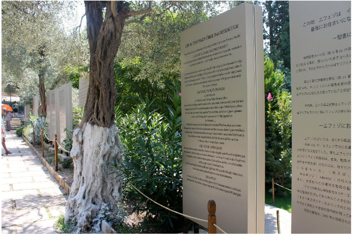
Figure 5.1. Historical Notes, House of the Virgin Mary, Turkey.