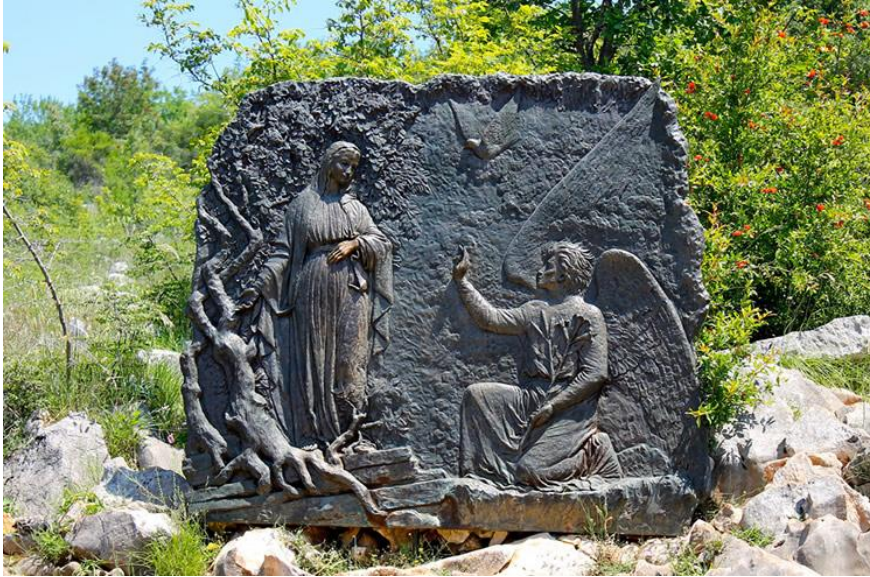
Figure 4.1. First Joyful Mystery, the Annunciation, on Apparition Hill, Medjugorje. Carmelo Puzzolo, 1989.