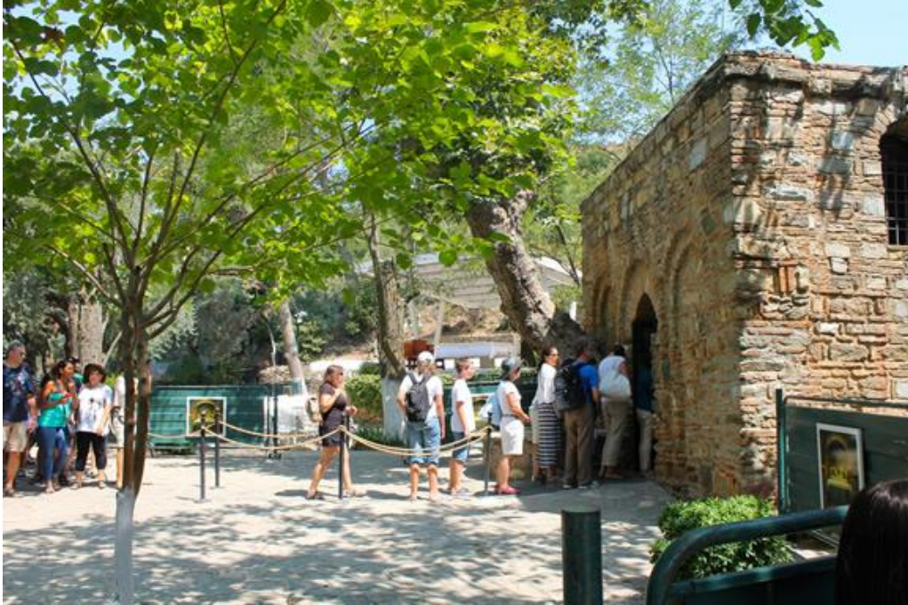
Figure 5.3. House exterior with lines, House of the Virgin Mary, Turkey.