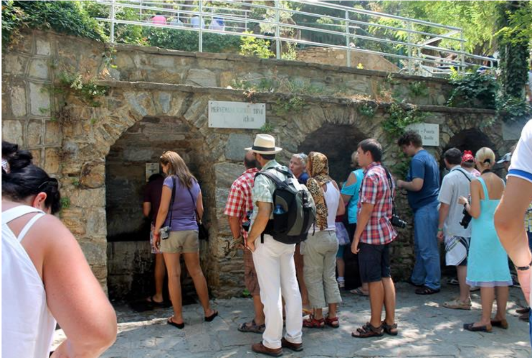
Figure 5.5. Wellspring, House of the Virgin Mary, Turkey.