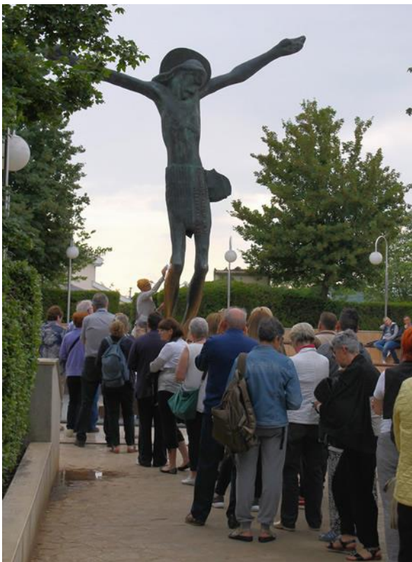
Figure 4.4. Christ as Risen Savior statue by St. James church, Medjugorje. Andrej Ajdič, 1998. Source: Photo, T.K. Rousseau, 2015.