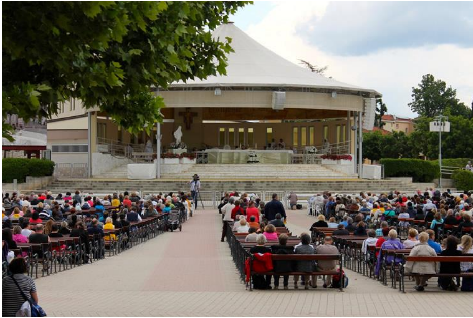
Figure 4.3. Outdoor altar behind St. James church, Medjugorje.