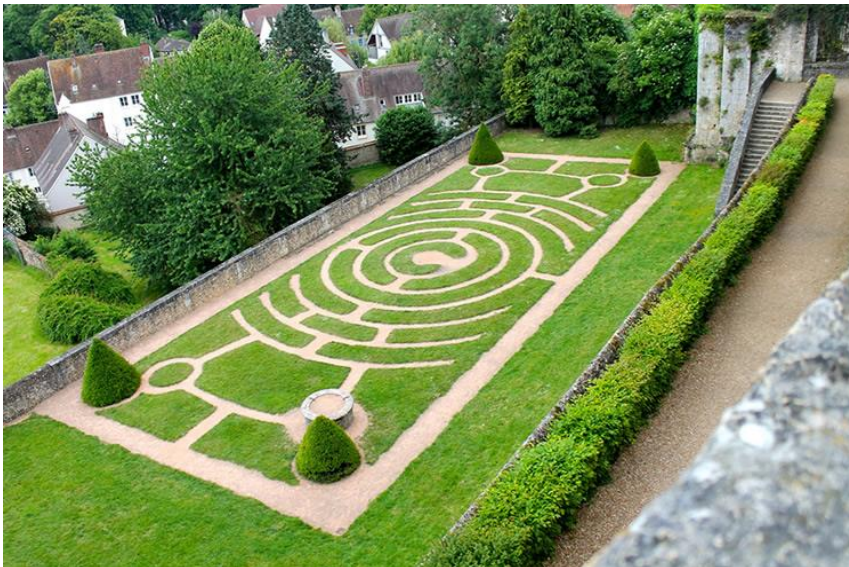
Figure 3.4. Exterior labyrinth, Chartres.