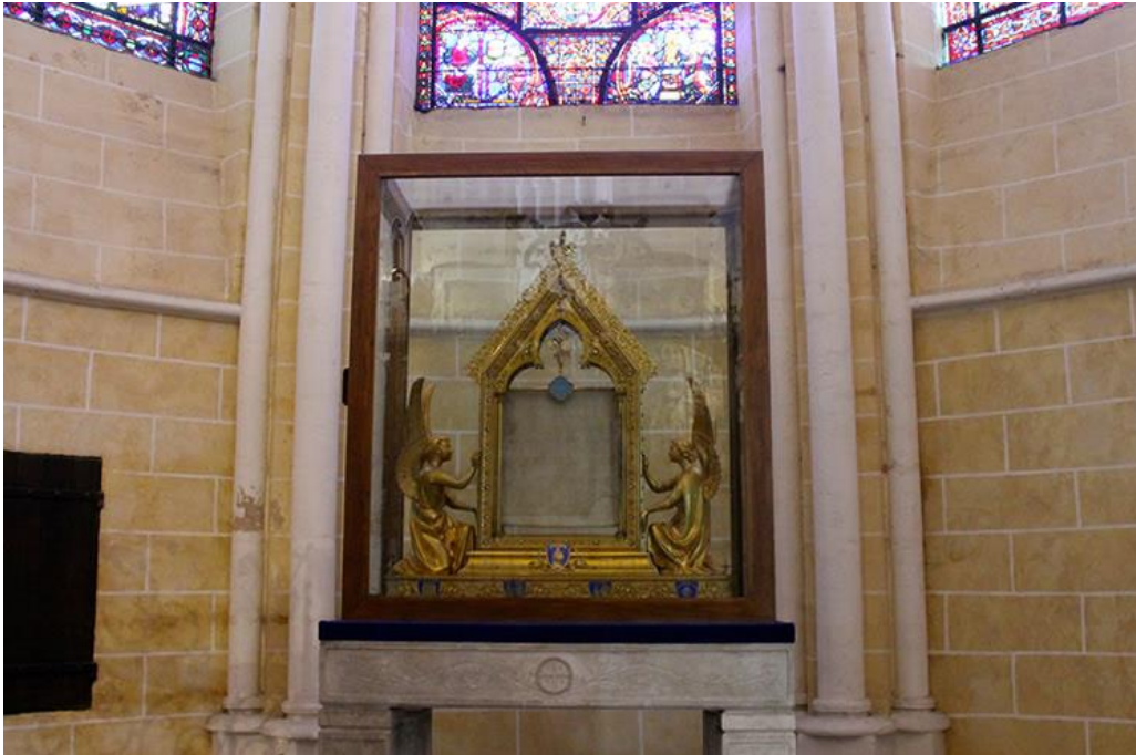
Figure 3.1. Sancta Camisia and reliquary, Chartres, France. Relic: gift of Charles the Bald in 876. Reliquary: 19 th century.