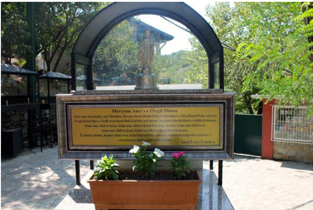
Figure 5.4. Prayer stand with statue of Mary, House of the Virgin Mary, Turkey.