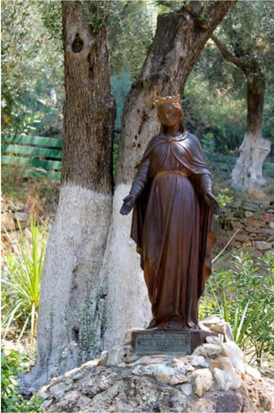
Figure 5.2. Statue of Mary, House of the Virgin Mary, Turkey. 1867.