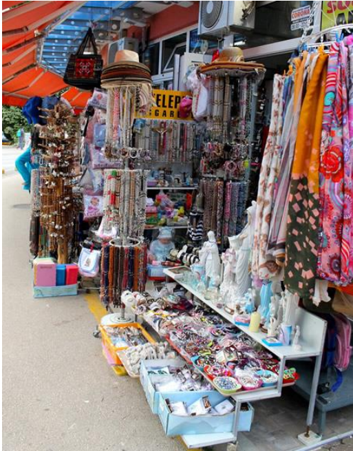
Figure 4.7. Shops with Marian memorabilia, Medjugorje.