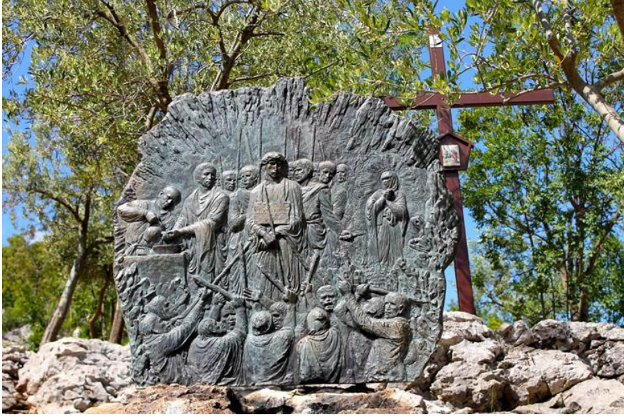
Figure 4.5. First Station of the Cross, Jesus is condemned to death, on Cross Mountain, Medjugorje. Carmelo Puzzolo, 1988.