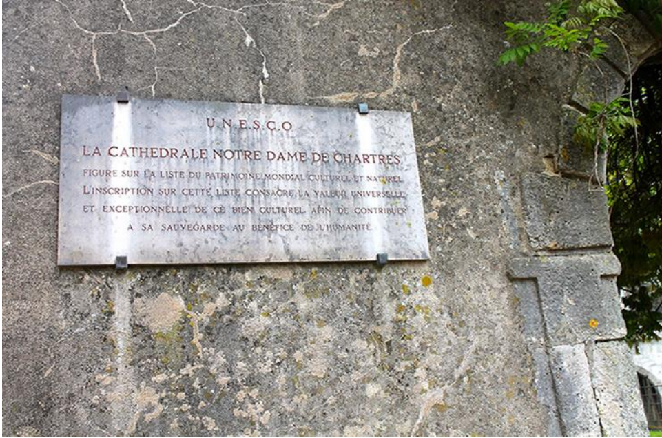
Figure 3.7. UNESCO World Heritage plaque on east cathedral grounds, Chartres.