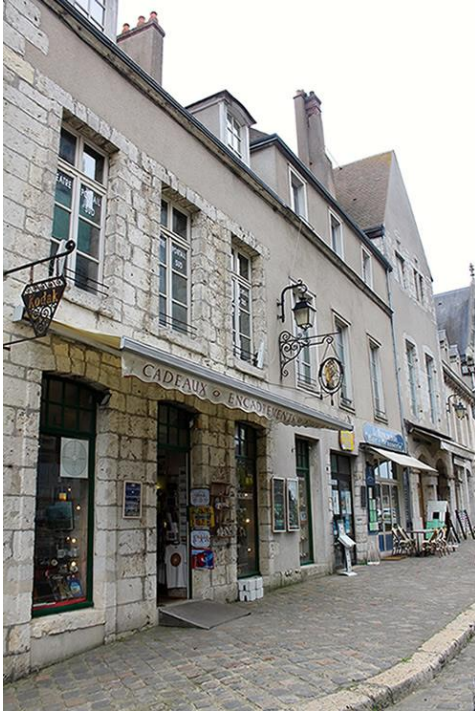
Figure 3.5. Shops facing south transept, Chartres.