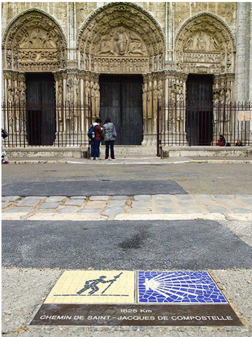
Figure 3.6. Mile marker for Santiago de Compostela pilgrimage outside West Portal, Chartres.