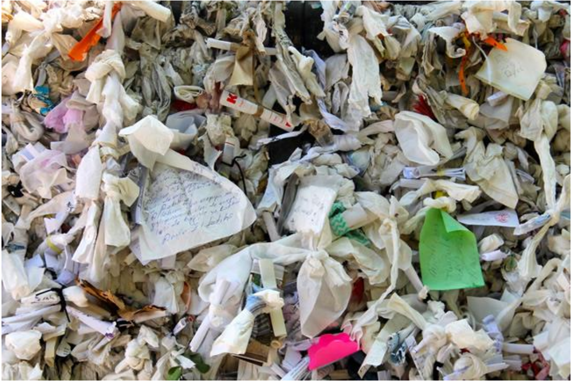
Figure 5.7. Wishing wall close up, House of the Virgin Mary, Turkey.