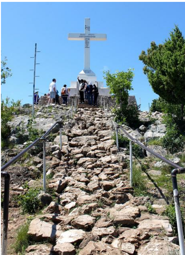
Figure 4.6. Cross at summit of Cross Mountain, Medjugorje.