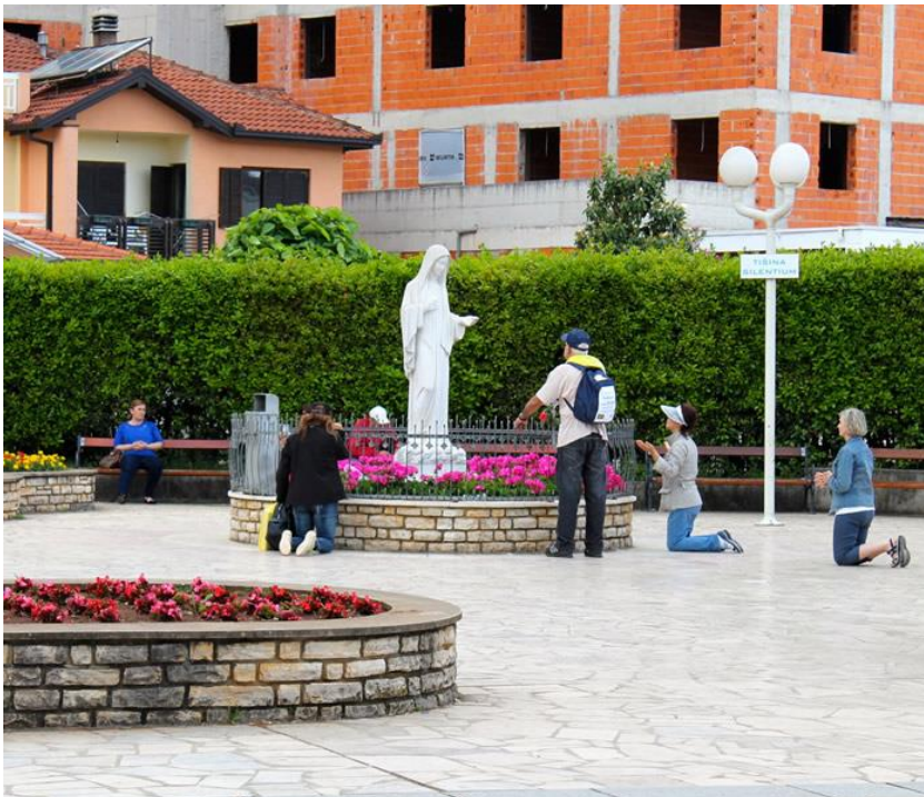
Figure 4.2. Queen of Peace statue in plaza of St. James church, Medjugorje. Dino Felici, 1987.