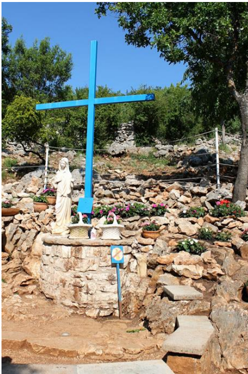
Figure 4.8. Blue Cross at base of Apparition Hill, Medjugorje.