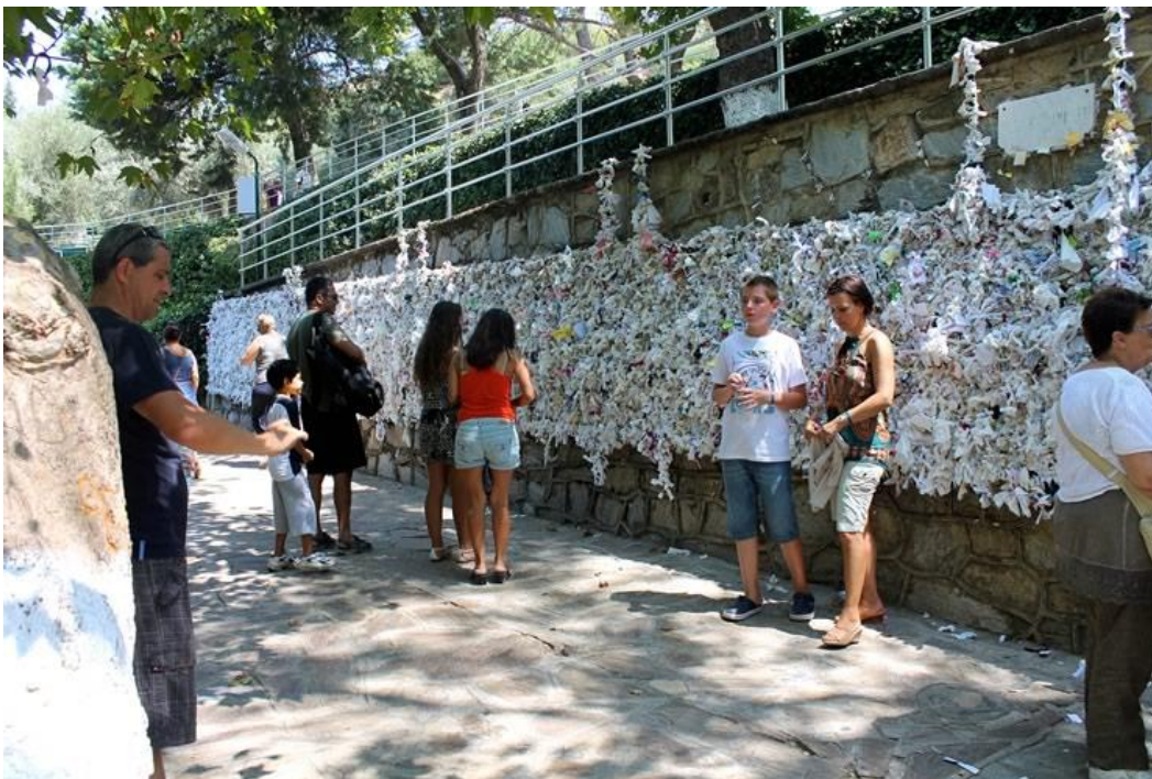
Figure 5.6. Wishing wall, House of the Virgin Mary, Turkey.