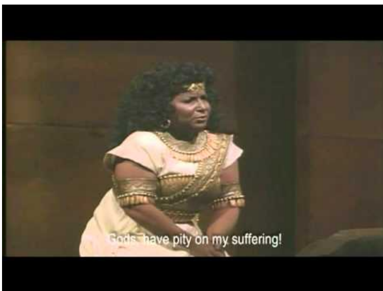
Millo as Aida 132