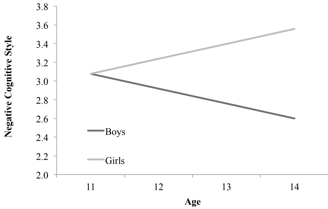
Figure 2. Sex difference in growth of negative cognitive style in early adolescence