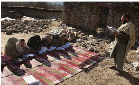
Typical village school in Afghanistan