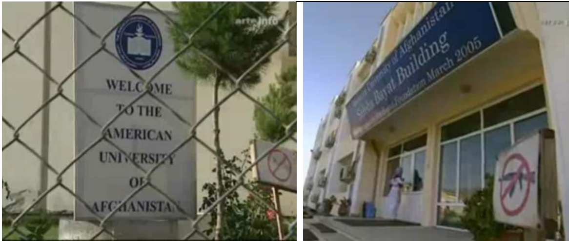
Entrance to the University and its administration building, originally Soviet built and occupied.

In early 2009, the library had five staff members: a professionally trained librarian /director and four local staff with limited experience and no formal library education.