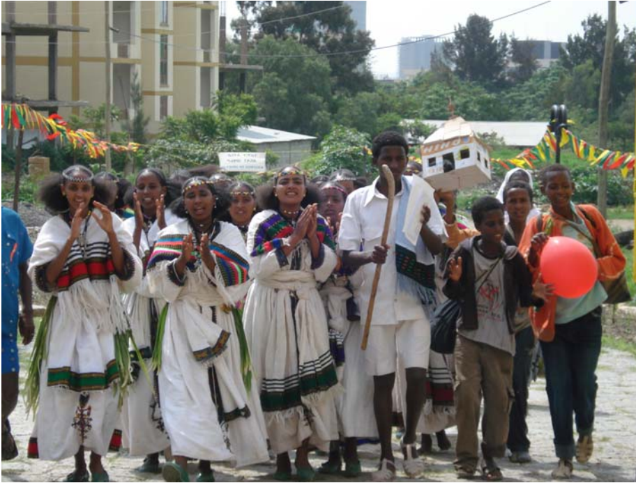
Photo 9. A group of Ashenda Girls (and boys) walked in from the town of Deberi to participate in the Ashenda festivities. This group won first place in a dancing/singing completion.