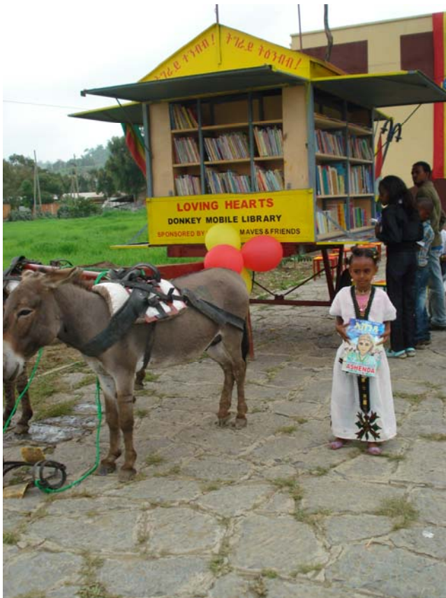
Photo 2. This Donkey Mobile Library was stationed at The Segenat during the dedication and attracted much attention.