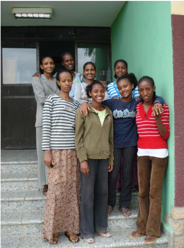
Photo 18. The library staff on the front steps of the Segenat Children and Youth Library. This group includes three assistants, three students, and two cleaners.