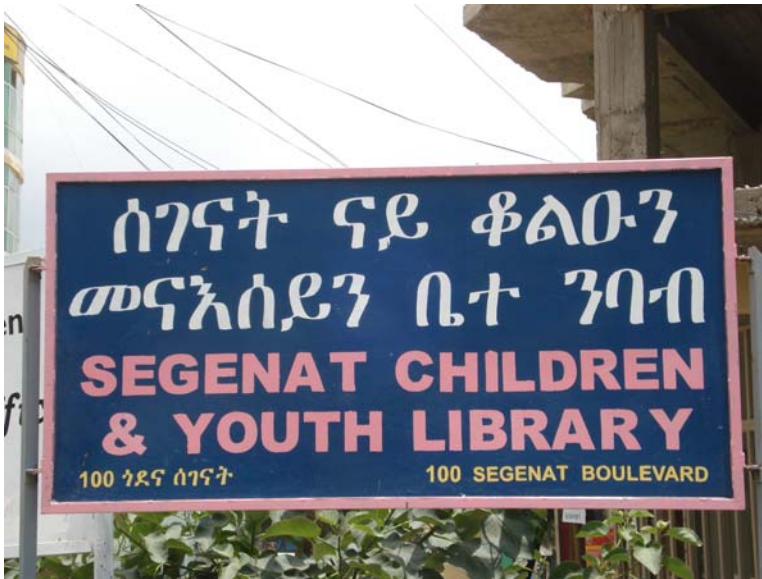
Photo 1. Sign on a crossroad near The Segenat Children and Youth Library stenciled in both Tigrigna and English.