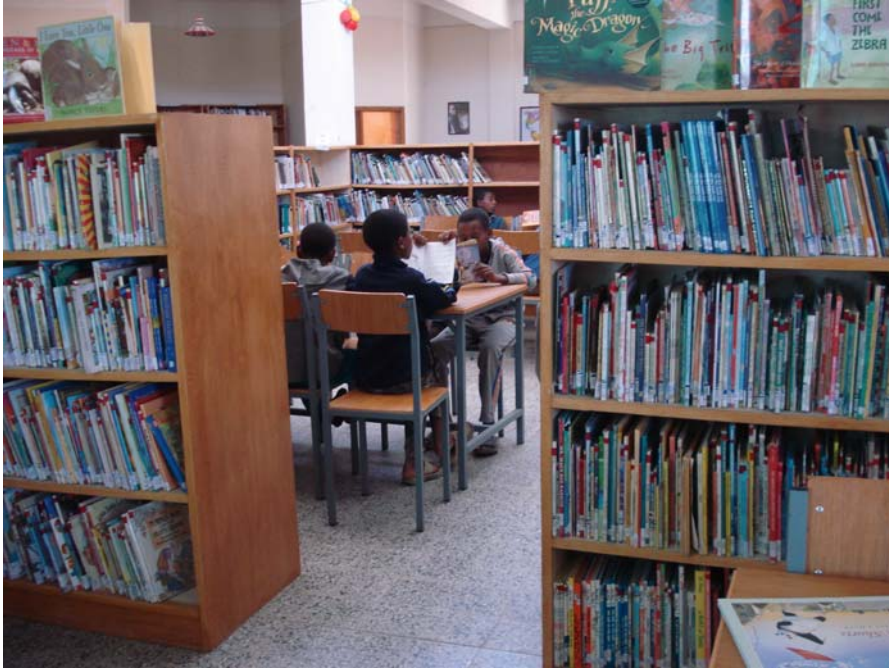
Photo 7. Units of shelving separated the youth section from the picture stories and the reading nook, allowing for both quiet and privacy for studying and research.