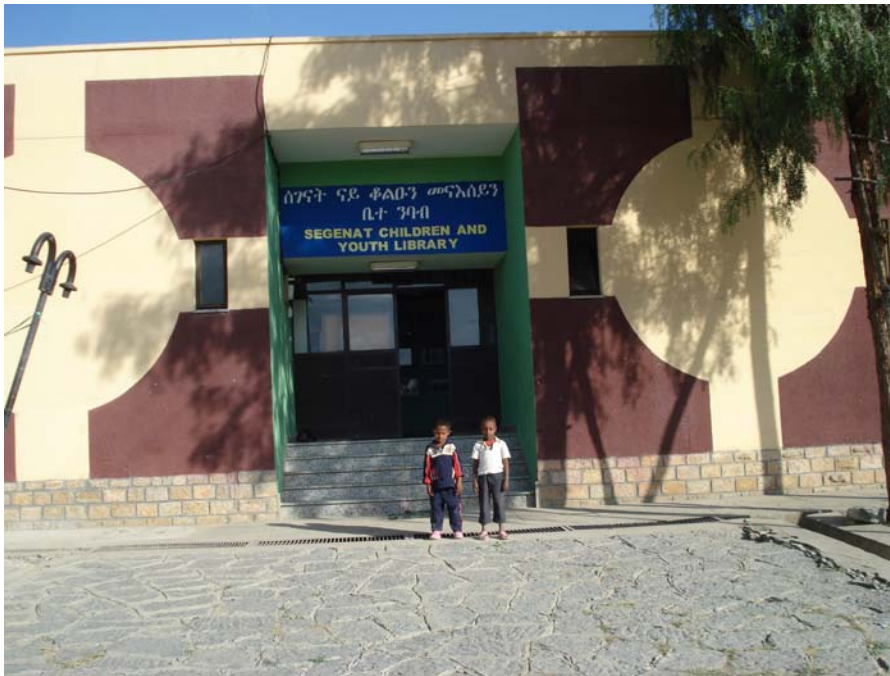
Photo 5. The Segenat Children and Youth Library is a free standing building that houses 20,000 books, a computer/media lab, small classrooms, and ample study space.