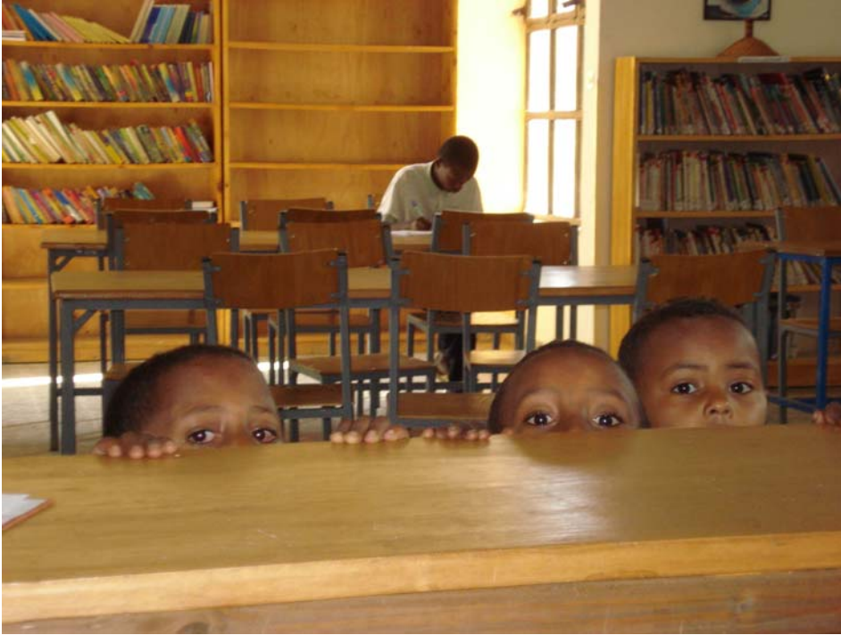
Photo 11. Three boys wait their turn to sign in to use the library. Initial registration includes their name, school, and age. Children walked to the library from all parts of the city and beyond.