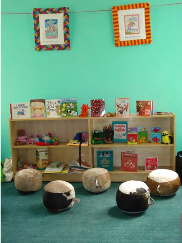
Photo 15. The alcove of the reading nook was the site of many arts and crafts activities. Locally made cowhide stools added additional seating and functionality. Two quilted wall hangings of Yohannes' books, Tirhas Celebrates Ashenda and Silly Mamo added whimsy to the décor.