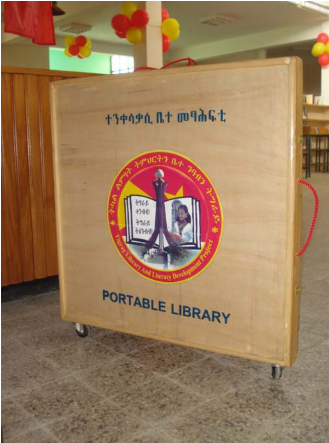
Photo 3. Portable Libraries, containing approximately two hundred books in English and local languages in a carrying case, serve the needs of small rural schools that have few classrooms.