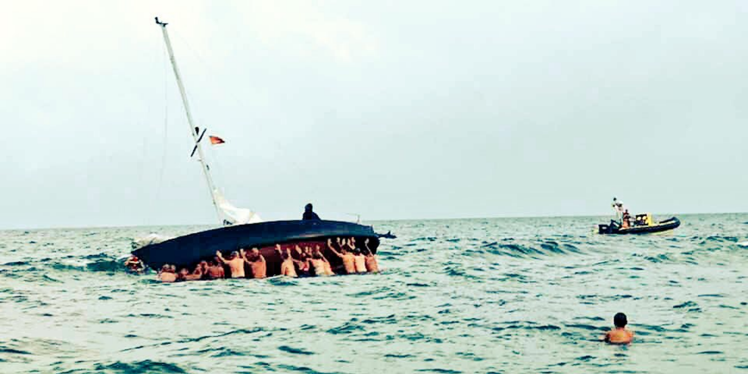
Co-operation move mountain (and sailboats)