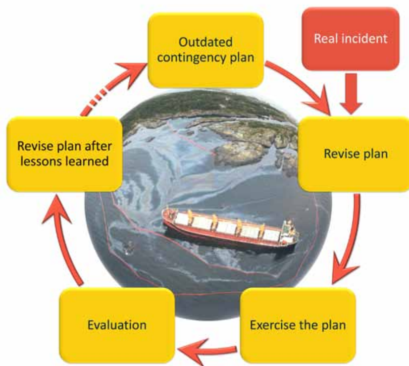
The Oil Contingency Planning Improvement Cycle

At what point a plan becomes outdated, should be defined in the plan itself. There will be an incentive to revise the plan, either by political will, a change in legislation or after a real oil spill incident, for example.