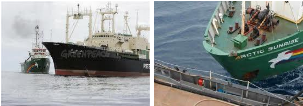
Figure 14. The Arctic Sunrise and the Nisshin Maru moments before the collision.

The Dutch-registered Greenpeace Arctic Sunrise and the Japanese-registered whaling factory ship Nisshin Maru collided on January 8th 2006 in the Southern Ocean, during an anti-whaling protest carried out by Greenpeace 79 . Both vessels resulted with minor damages so seaworthiness was not compromised; also there was no loss of life.