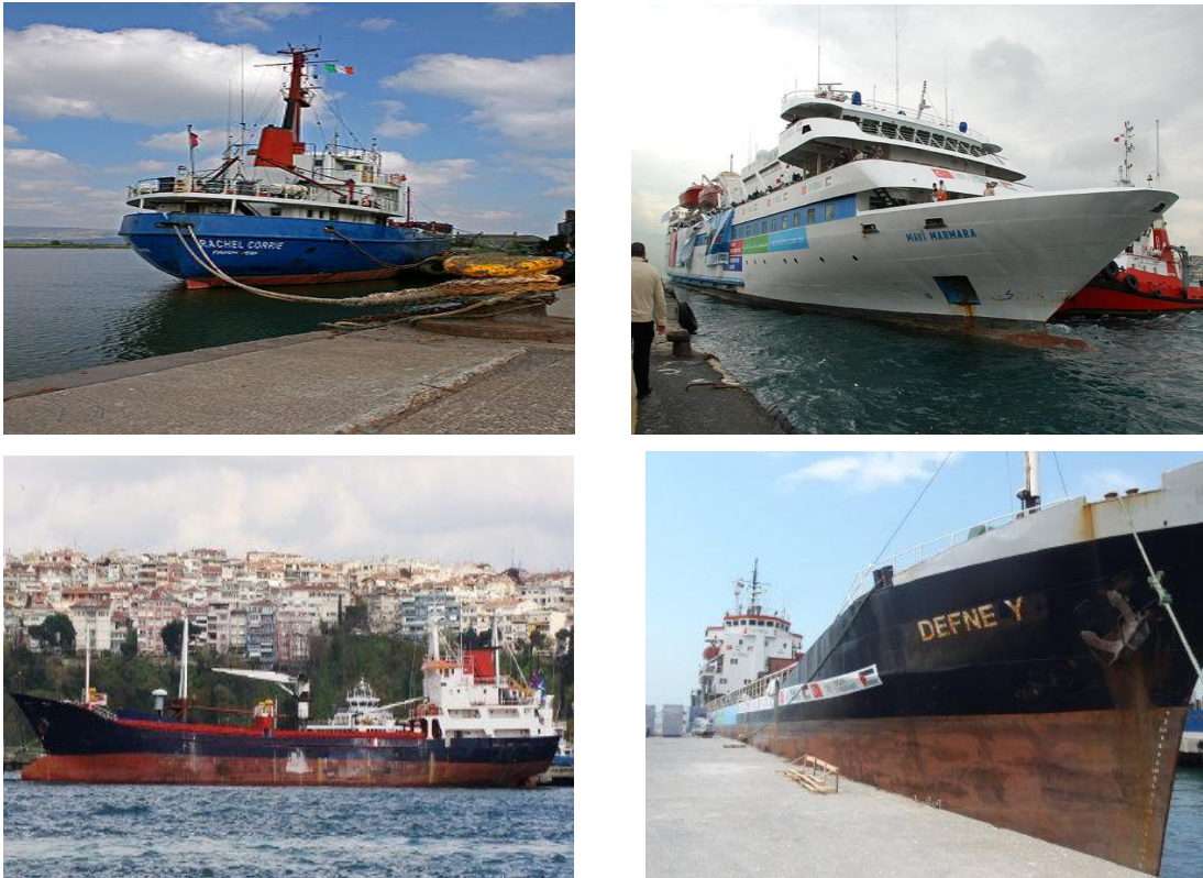
Figure 13. From top to bottom and left to right, the Rachel Corrie, the Mavi Marmara, the Gazze and the DefneY.