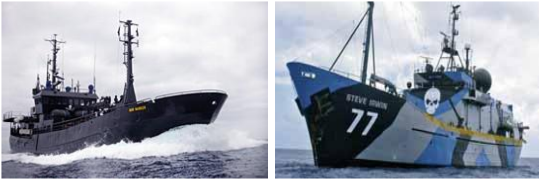
Figure 9. The Bob Barker and the Steve Irwin.

At present, SSCS operates 3 ships: the Bob Barker , and the Steve Irwin and the Brigitte Bardot .