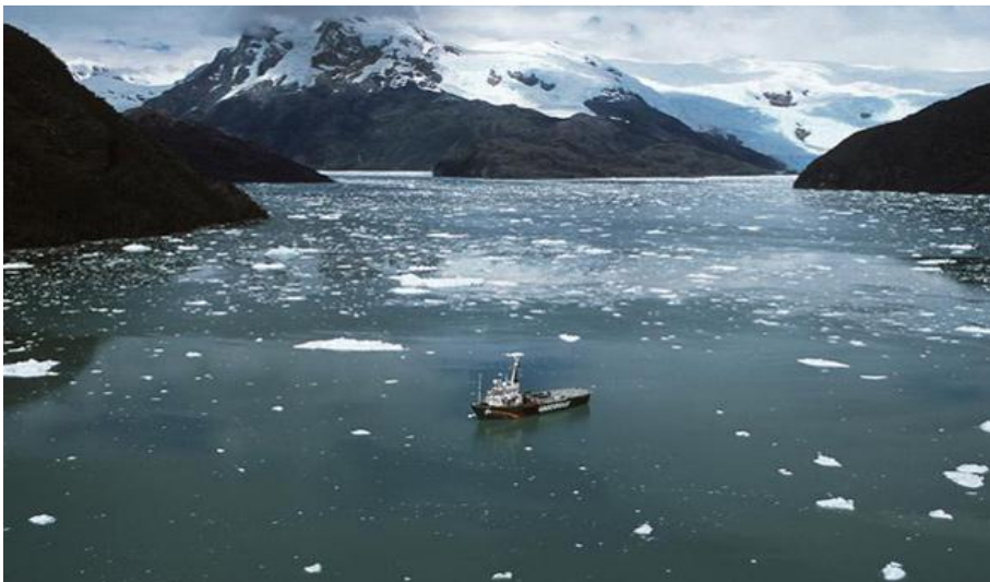
Figure 1. The Greenpeace ship Arctic Sunrise in Greenland, 2009.

Although ships need fuel and provisions, they are self-sufficient floating crafts which can navigate the world's waters. This quality gives ships the capability to not only reach but also remain in many places including the ones that are not easily accessible such as the Arctic or Antarctica, and to carry to those places people and equipment.