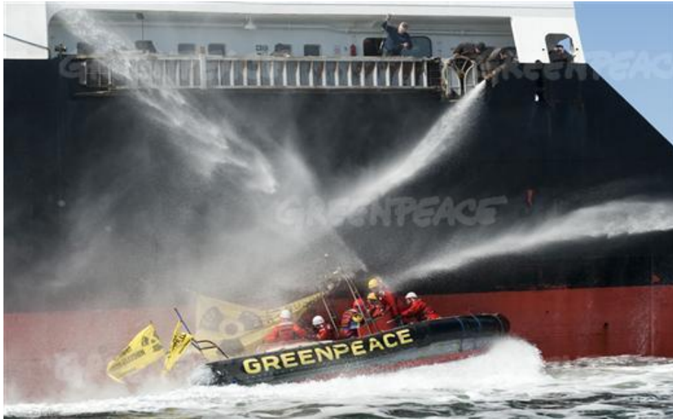
Figure 19. Greenpeace activists protest with banners reading 'Russia is not a nuclear dump' alongside the Russian transport ship Kapitan Kuroptev which is carrying radioactive waste from France to Russia.

direct action protest. The boarding was repelled by the crew and the Kapitan Kuroptev went into port to load her cargo.