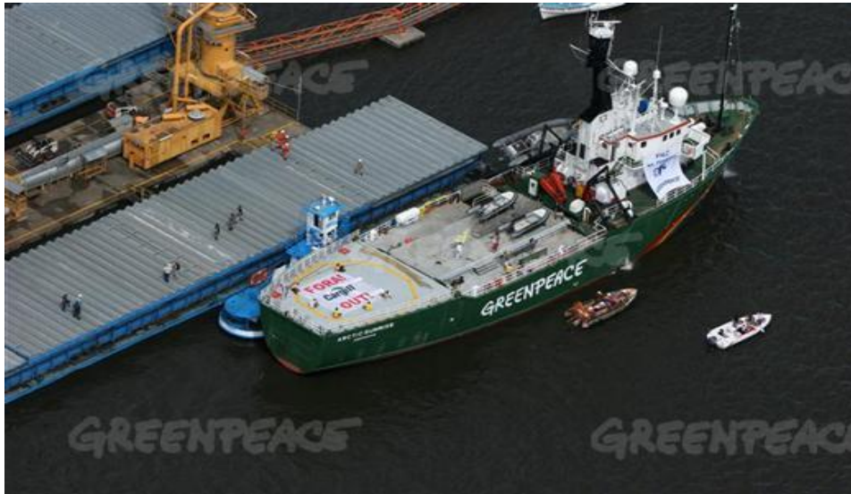
Figure 22. The Arctic Sunrise blocking the path of a smaller Cargill ship containing Amazonian soya.

Several law suits were filled not only by Cargill to keep the facility open but also to shut it down by the Instituto Brasileiro do Meio Ambiente e dos Recursos Naturais Renováveis (IBAMA) 98 . IBAMA is the Brazilian Ministry of Environment enforcement agency.