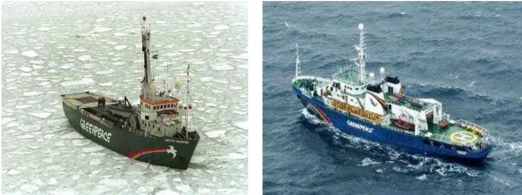
Figure 7. The Arctic Sunrise and the Esperanza .