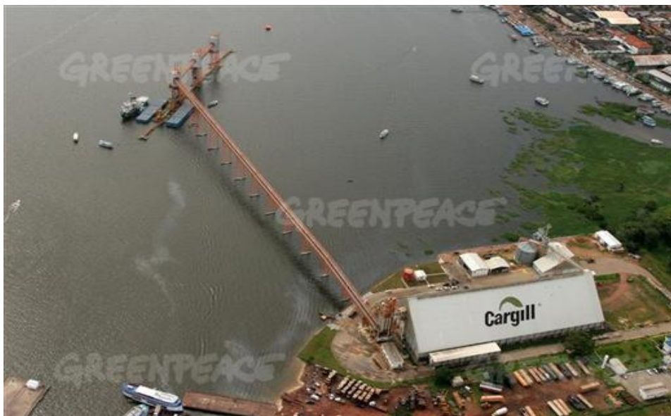
Figure 21. Full view of the Cargill factory from above and the Arctic sunrise .

Santarem lies in at the Tapajós River and the Amazon River confluence; it is a city part of the state of Pará in Brazil.