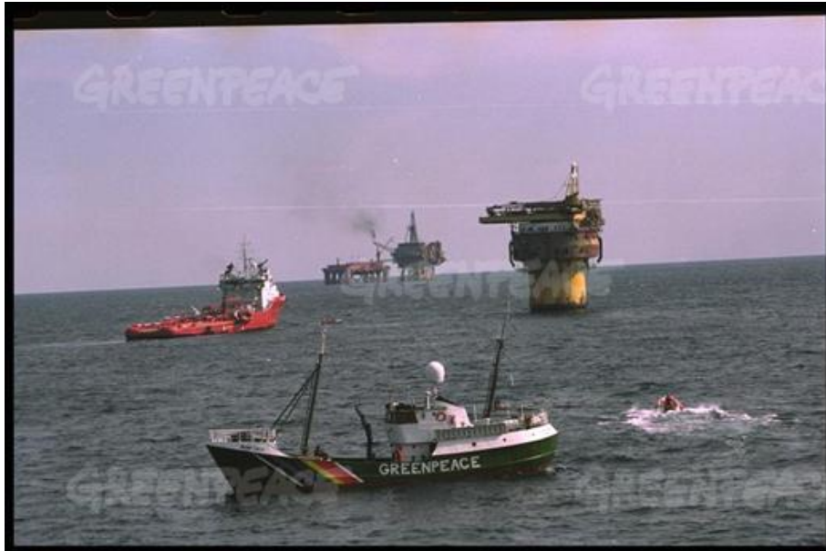
Figure 16. The Greenpeace vessel Moby Dick stood by as a safety vessel at the Brent Spar . 30/04/1995.