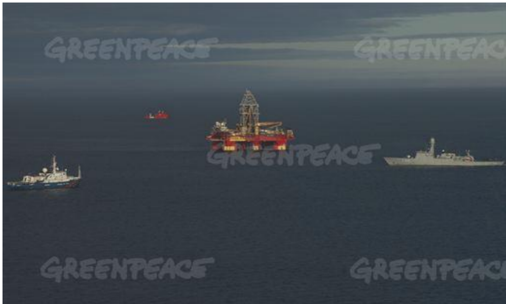
Figure 17. From left to right, the Esperanza , the Greenland Police patrol boat, the Stena Don and the Danish Navy vessel F359 off Greenland.

In September 2010, a small number of activists from the Greenpeace's ship Esperanza climbed and occupied the oil exploration rig Stena Don off the west coast of Greenland for a couple of days until they desisted due to adverse weather conditions.