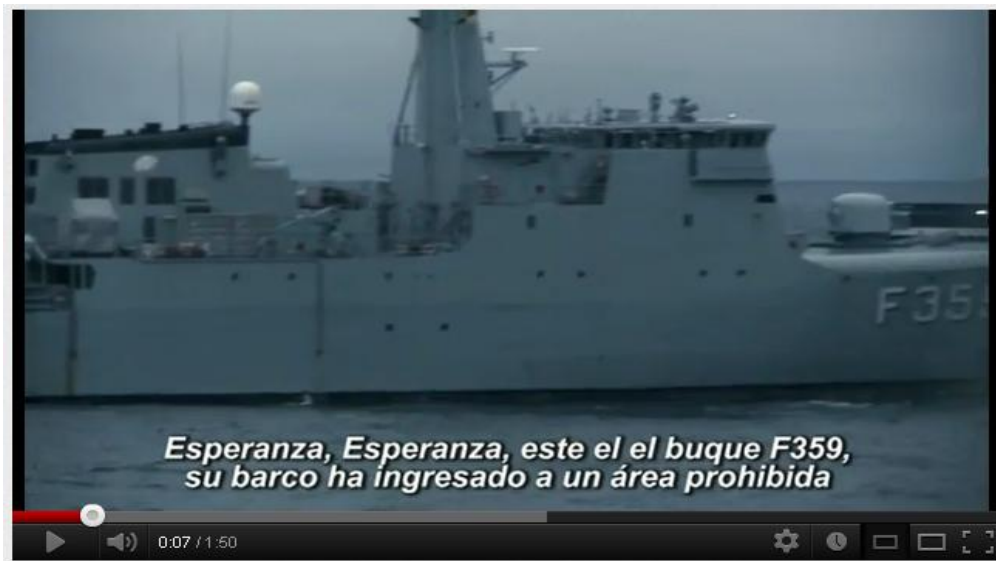
Figure 18. Watch video clip of the VHF radio communication between the Danish Navy vessel Vædderen (F359) and the Esperanza .

When the Esperanza's fast boats carrying activists entered the 500-m safety zone the Vædderen called the Esperanza over the VHF radio to inform about the possible consequences of the breach.