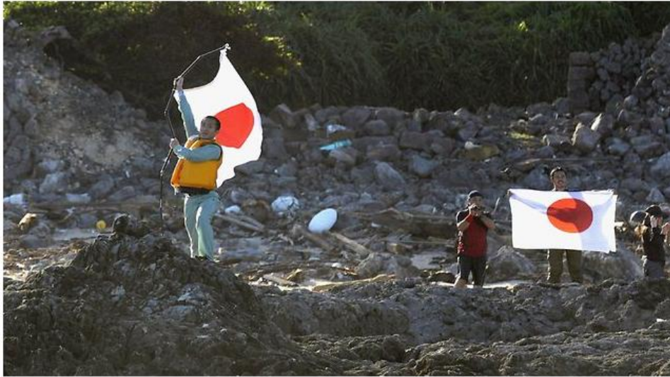
Figure 2. Japanese activists hold the national flag Uotsuri Island, one of the disputed islands of Senkaku in Japanese and Diaoyu in Chinese, in the East China Sea.

Taiwanese protesters on ships in 2008, and by two flotillas, one with State-supported activists from Hong Kong 43 and another one a few days later by Japanese activists from the Ganbare Nippon right-wing group 44 .