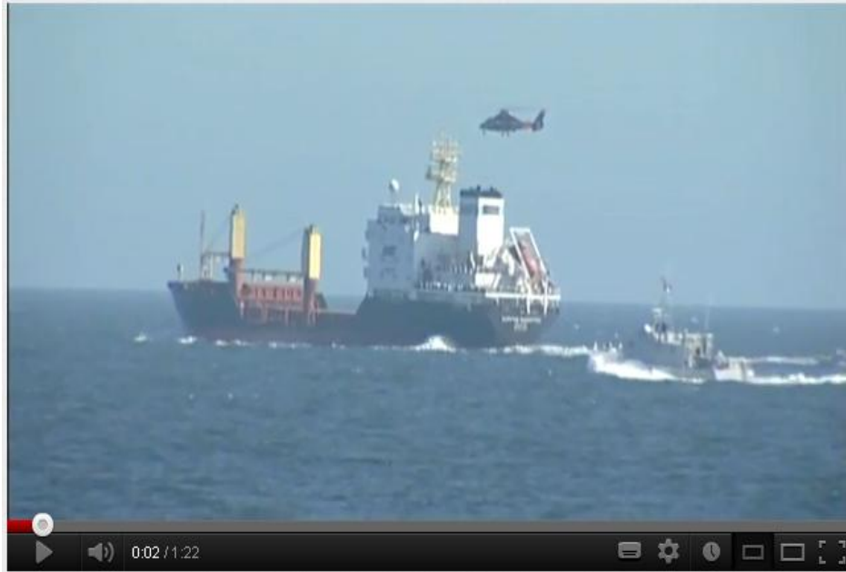
Figure 20. Rough video on French security personnel disembarking just before the Kapitan Kuroptev leaves French territorial waters, the Esperanza escorting the Kapitan Kuroptev and further actions.