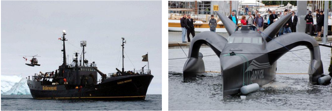
Figure 11. The Farley Mowat and the Ady Gil.

The Sea Shepherd claims to be a "law enforcement" organization based on its interpretation of articles 21 and 24 of the United Nations World Charter for Nature 72 . This interpretation has been a matter of debate among international law experts. However, there is consensus that private individuals or groups cannot take the law into their own hands. Furthermore, the World Charter for Nature is a non-binding instrument.