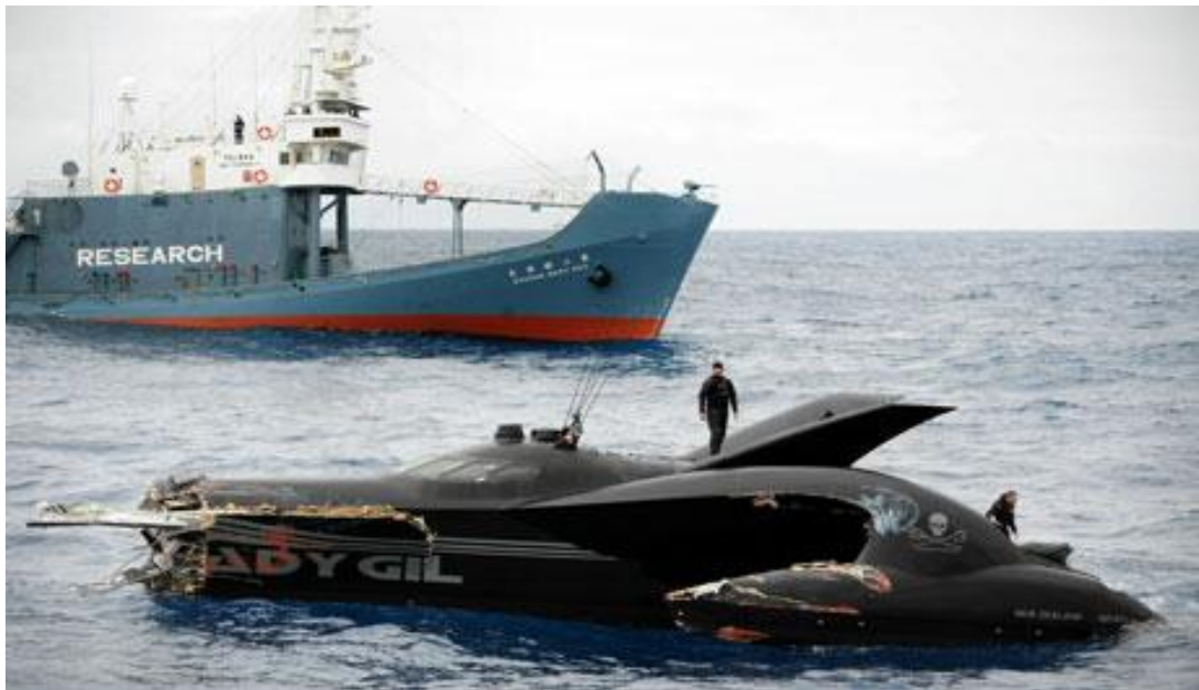
Figure 15. The Sea Shepherd's ship Ady Gil after it was hit by Japanese whaling vessel Shonan Maru in Antarctic waters.

The incident took place in the high seas where Flag States, Japan and New Zealand in this case, have jurisdiction over their ships according to UNCLOS 86 . Therefore their national laws apply to their ships on the high sea. On collision matters UNCLOS is clear in its Article 97 87 . However, Australia has Search and Rescue (SAR) jurisdiction in that specific area.