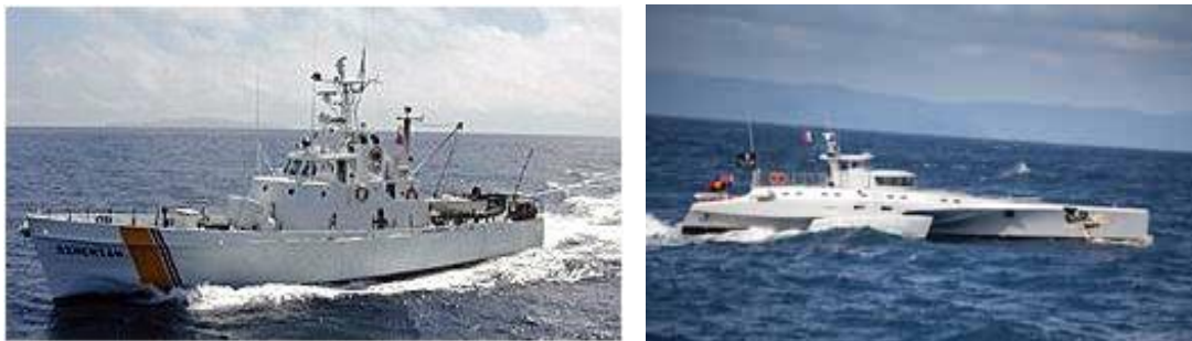
Figure 10. The Yoksha and the Brigitte Bardot.

According to Lloyd's List Intelligence the Bob Baker is registered in The Netherlands as "research" but a confidential source confirmed that she and the Steve Irwin are registered as "yacht" in Rotterdam.