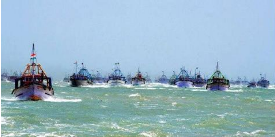
Figure 3. Indian fishermen in more than 2,000 boats blocked the channel of the Tuticorin port.

The above facts demonstrate that ships are now widely used to carry out protest at sea in any jurisdiction, not only for peace or environmental issues but also for political ones such as human rights and sovereignty. Consequently, protest players have essential roles worth being investigated.