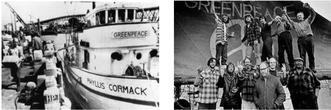
Figure 6. The Phyllis Cormack and her crew before departure.

Greenpeace's ships are managed and operated by Stichting Greenpeace Council ( Stichting means foundation in Dutch - SGC) with address in Amsterdam, the Netherlands. Currently SGC manages and operates three ships: the Esperanza , the Arctic Sunrise and the Rainbow Warrior III . However, the owners of the vessels are different foundations. For the Esperanza and the Arctic Sunrise the owner is Stichting Phoenix and for the Rainbow Warrior III is Stichting Iris, both owners with address in Amsterdam.