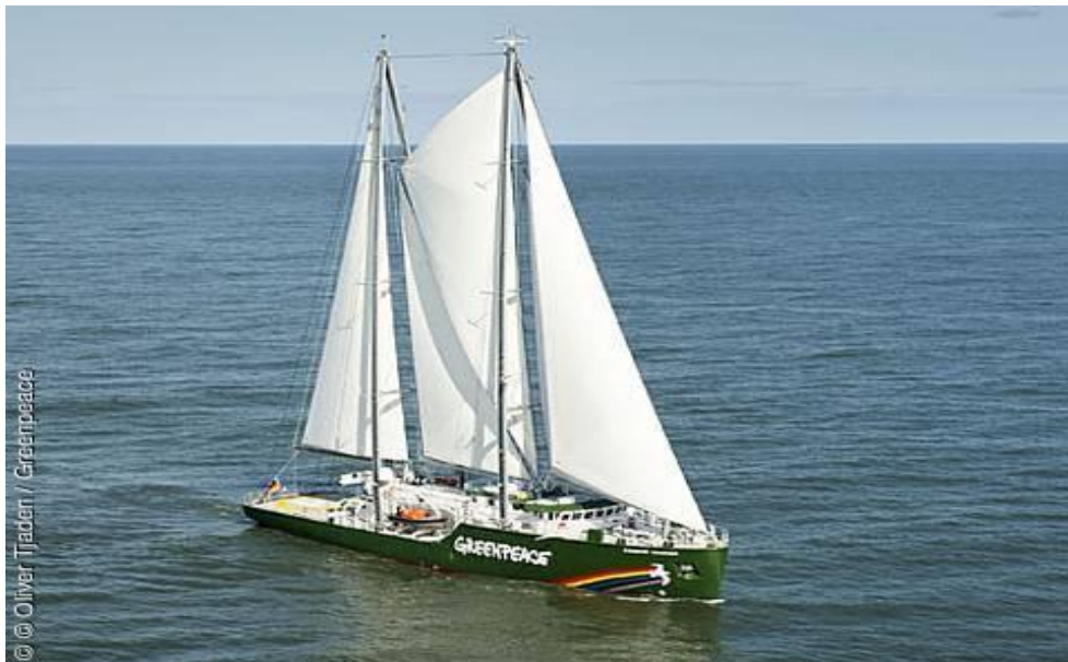
Figure 8. The Rainbow Warrior III .

DNV classifies the Esperanza and the Arctic Sunrise as ice-class vessels 66 . And GL classifies the Rainbow Warrior as 100 A5 Motor Sailing Vessel.