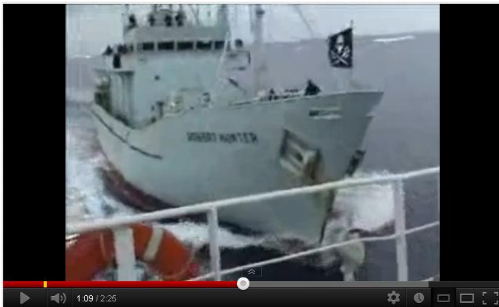
Figure 4. Video clip on "Sea Shepherd attacks Japanese whaling fleet".

Sea Shepherd's ships have been de-flagged on various occasions after serious violations to the COLREGs and complaints from the protest target ship's State to the protest ship's Flag State. For instance, the Robert Hunter (renamed Steve Irwin in 2007) was registered in the United Kingdom. After a confrontation with the Japanese whaling fleet in the Southern Ocean in 2007, Japan made a formal complaint to the British authorities. The Robert Hunter was struck off the British Ship Register but Maritime Coastguard Agency insisted that it was not under the Japanese government pressure but due to inconsistencies between the "pleasure yacht" registration and the ship's activity 55 .