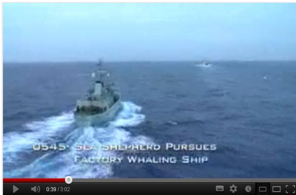
Figure 12. Video clip on "law enforcement" action by Sea Shepherd against the Nisshin Maru.

The Sea Shepherd claims to be a "law enforcement" organization based on its interpretation of articles 21 and 24 of the United Nations World Charter for Nature 72 . This interpretation has been a matter of debate among international law experts. However, there is consensus that private individuals or groups cannot take the law into their own hands. Furthermore, the World Charter for Nature is a non-binding instrument.