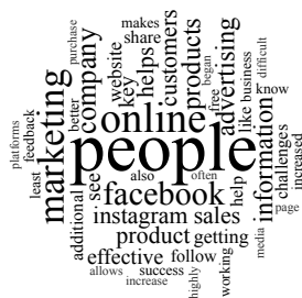
Figure 1. Word cloud with recurring terms from semistructured interviews.

In this study, I discovered an efficient way for small retail business leaders to use online marketing effectively. Business leaders must develop and implement various strategies to succeed in the retail industry. Figure 1 is a word cloud that lists some of the recurring terms from the semistructured interviews, such as Facebook , Instagram , strategies , people , follow , challenges , sales , products , advertising , share , and feedback .