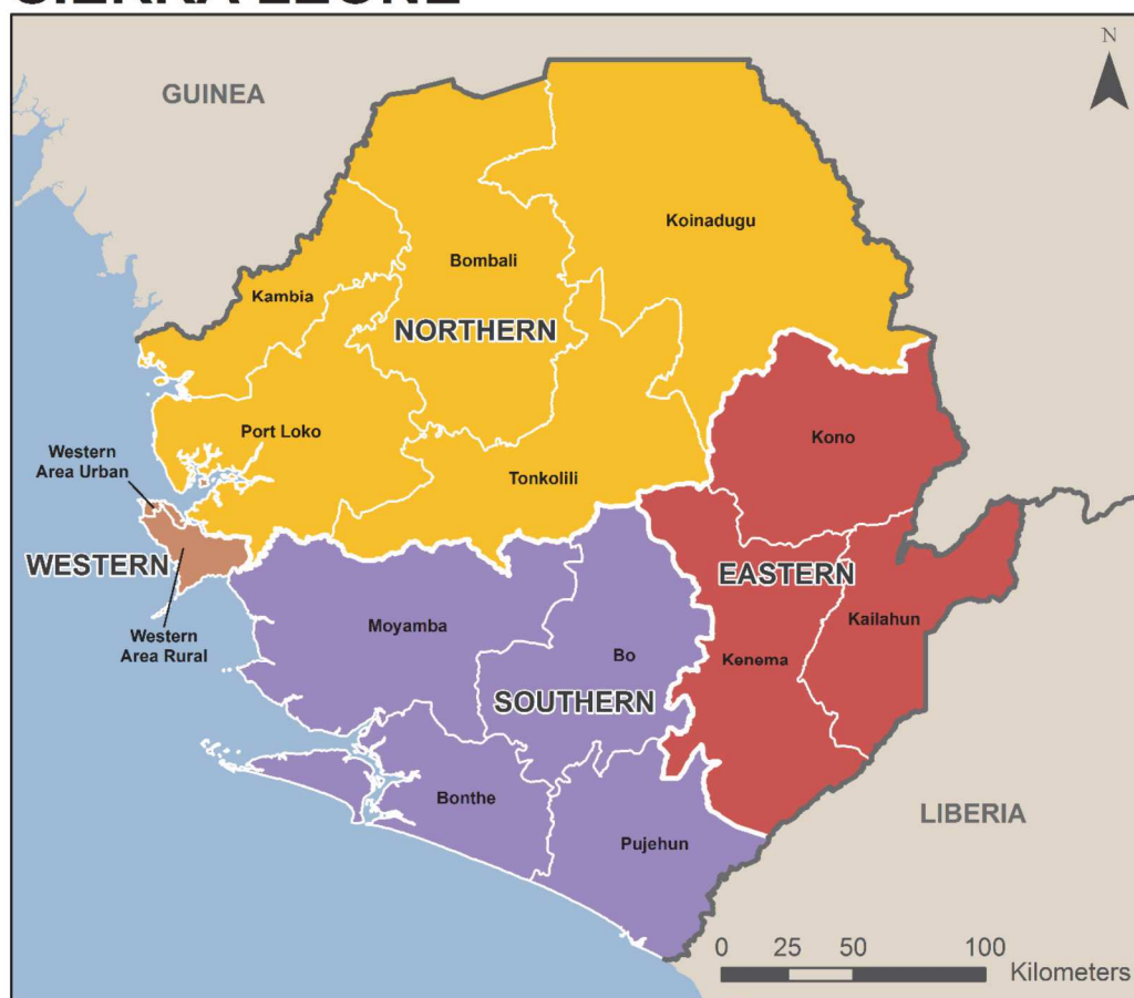
Figure 2. 2013 Sierra Leone Demographic and Health Survey.