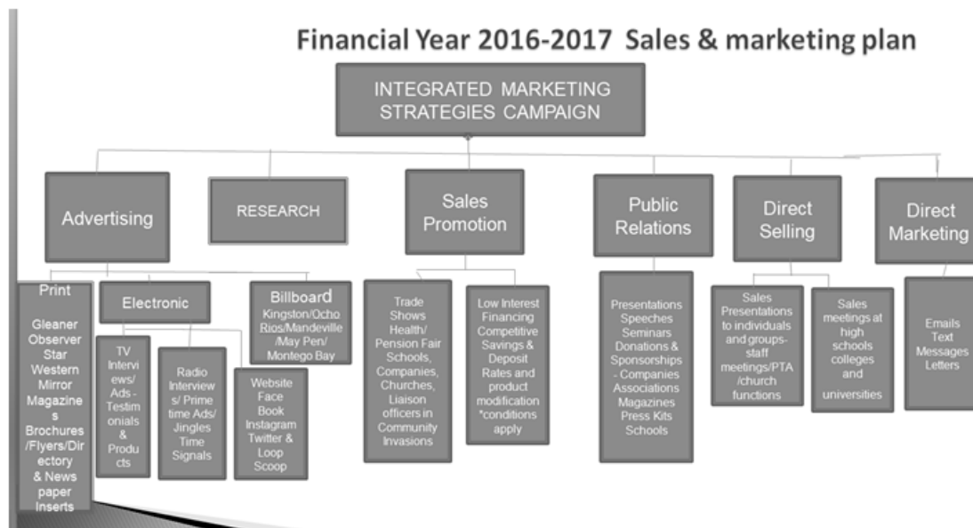
Figure 1. First page of integrated marketing plan (example). Reprinted with permission (see Appendix F).

in our marketing calendar and we do marketing expos at the beginning of our financial year. Our main objectives of these expos are to build awareness about our products and services through simulation exercises that depict how a specific product or service would benefit a member in a particular life event.