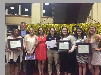
The Cardinal Leadership Awards