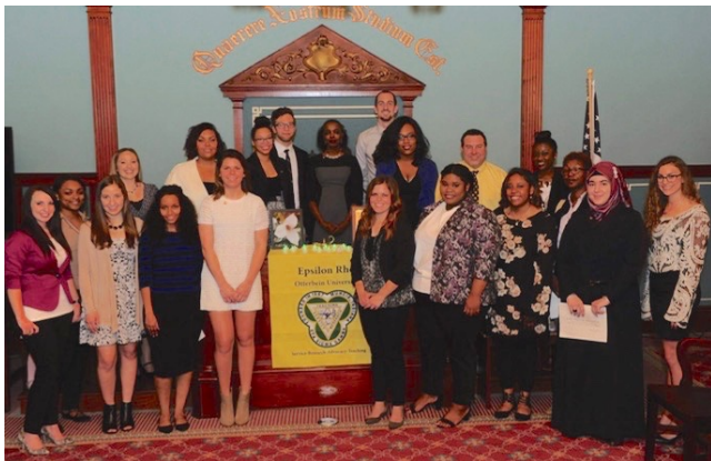
Inaugural initiation of Eta Sigma Gamma

http://www.otterbein.edu/Spotlights/otterbeins-eta-sigma-gamma-honorary-brings-national-recognition-for-public-health-education-majors