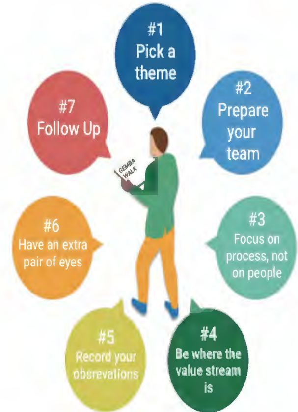
Gemba Walk in 7 steps