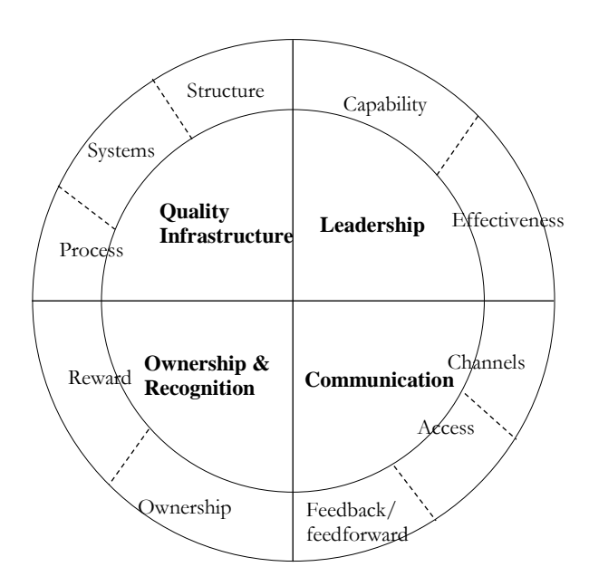
Figure 2 – Dimensions for building a quality culture in the student body

A model is proposed that unpacks each of the four domains into disparate dimensions which form the basis for building a quality culture in the student body. This model is adapted from Srinivasan &Kurey (2014). For illustration purposes, the domains and their dimensions are given in Figure 2. The four domains have a total of ten dimensions.