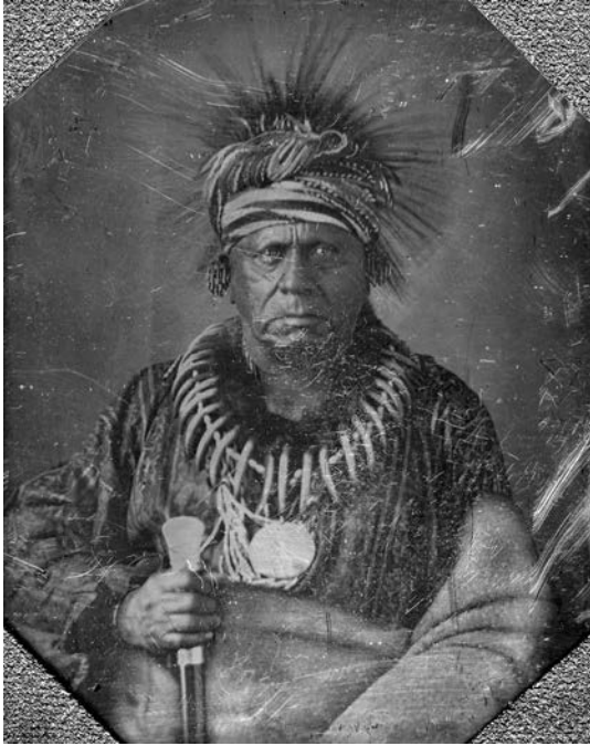
Figure 2. Chief Keokuk aka the Watchful Fox. Daguerreotype, 1847.

workings of the Indian Office and the protocols of Indian diplomacy. During the War of 1812 a Sauk tribal council had first appointed him as war chief, after which he became “a spokesman for the tribe with the United States government” and engaged in treaty councils with Thomas Forsyth and William Clark as early as 1816. 33 In 1824 he took part in a tribal delegation to Washington, where he contested the Osages’ sale of lands in Missouri, arguing successfully that these lands belonged to the Sauk “by the same right by which the United States claimed its land, by right of conquest.” 34 And in the summer of 1830 Keokuk secured a thousand dollar payment of trade goods to compensate for the death