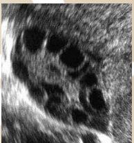
Figure 1: Ovary with cysts on ultrasound

The exact pathophysiology of PCOS is complex and remains largely unclear to the medical world. Within the last several years research on PCOS has been on the rise. Therefore, it is important for healthcare professionals and policy makers to translate new research into knowledge and action (Teele et al., 2013).