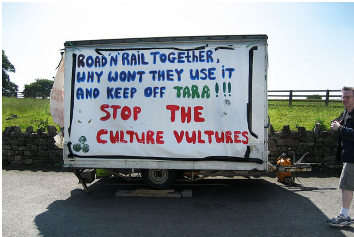
Figure 5. Protest Sign Outside Tara.

group at the heart of the resistance was TaraWatch, a loosely structured internet-based organization led by Dublin lawyer Vincent Salafia. Throughout their campaign, TaraWatch utilized an array of institutional and extra-institutional strategies of action to garner support for its cause. These included direct protest, letter and petition writing campaigns, lawsuits, and appeals to the international community. While construction on the road continued, TaraWatch gathered supporters. At the height of the conflict in 2009, the group had over 13,000 official members, a sizeable support network amongst the Irish diasporic community in the United States, active membership involved in protest events as far away as Australia, New York, and Los Angeles, and backing from internationally-known Irish celebrities, including Bono, Jonathan Rhys Myers, Gabriel Byrne and Stuart Townsend (Tara Watch 2010). Archaeological, governmental and public interest organizations from around the world, including the Archaeological Institute of America, the International Celtic Congress, the City of Chicago, and the Massachusetts Archaeological Society issued public statements denouncing the construction and joined TaraWatch in urging that the road be re-routed outside the Tara complex (Tara Watch 2010). While TaraWatch certainly had support from community members, as evidenced by the