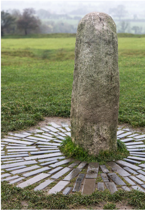
Figure 2. The Lia Fail at the Hill of Tara..