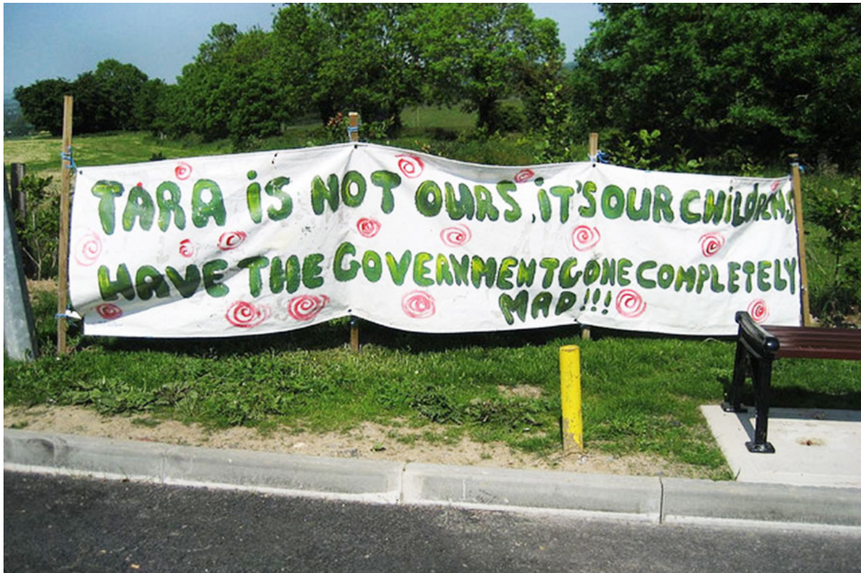
Figure 6. Protest Sign Outside Tara.

democracy that were won at such high costs less than a century ago. In the eyes of opponents, it is not the Irish people who have chosen to prioritize infrastructure development over Ireland's sacred sites, but rather corrupt politicians who have been captured by non-Irish private interests. References to the failings of democracy over the issue and allegations of corruption are prevalent among oppositional discourses. In its mission statement TaraWatch presents its main objective as "restoring the democratic deficit on the Tara issue" (TaraWatch 2010, emphasis added ). Taking it further, an editorialist in the Irish Times responded to allegations that the archaeological studies of the site had been falsified, arguing that "altering independent advice to fit hidden agendas is a dangerous corruption of [the] working of Government in itself, more typical of systematically dishonest regimes than a democratic country like ours" (Byrne 2008).