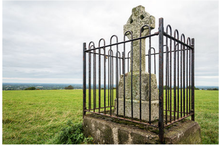
Figure 3. Celtic Cross at the Hill of Tara.

Perhaps most striking to modern-day visitors to the Hill of Tara is the natural beauty of the landscape, which remains relatively unaltered and unexcavated. Only two of the dozens of monuments on the hill have been fully unearthed, leaving sightseers with a virtually empty natural canvas on which to reconstruct in their own imaginations the political, spiritual and ceremonial events that have taken place on the site over the course of millennia. While Tara's landscape is certainly powerful enough to evoke awe in the minds of transient tourists, its influence on the Irish people goes far deeper. For them, Tara is a place where the past and the present unite. Certainly the historical events that transpired at Tara, and the people who chose to assert their authority on the hill, give the site much of its mythical relevance. But perhaps more significant than what occurred at Tara are the reasons ancient and contemporary leaders chose this place as their font of power and authority. Standing atop the ancient site, one can surmise that there is something about the land itself, something perceived as timeless and powerful that drew them here time and again.