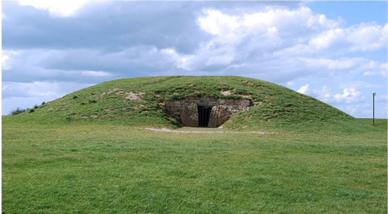
Figure 1. The Mound of Hostages on the Hill of Tara.

been a sacred site to the early peoples of Ireland, and also to modern Irish whose Catholicism forms a central component of their personal and nationalistic identities. Indeed, Tara symbolizes a sacred crossroads in Irish history – one where the transformation of the very soul of Ireland was negotiated in a relatively peaceful manner.