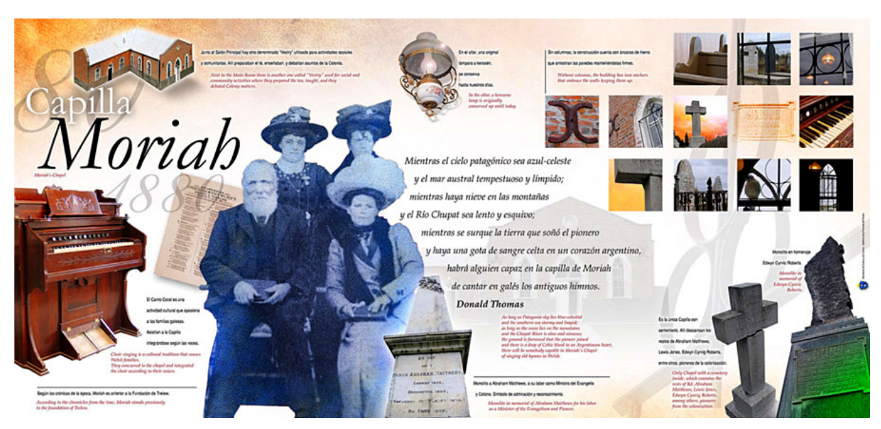
Figure 2. Brochure promoting the Moriah Chapel, Chubut Valley.

Below the government level, the private sector is also tapping into the revival of interest in Welsh culture. Quoted below is an extract of just one of the many commercial websites touting Patagonia to potential visitors: