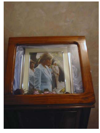
Figures 6-8. Commemorative plaques and photographs of Lady Di's visit to Tŷ Te Caerdydd (on display in the tea house).

Of course a good number of locals bemoan in private conversation the commercial success of this 'illegitimate appropriation', denouncing that the non-Welsh origins of the owners of the 'alien' tea house prevent them from providing an 'authentically Welsh' tea service. Alongside the appetising experience, tea houses owned by Welsh descendants are supposed to offer access to the history and culture of the community as part of the service through interaction with the protagonists of the epic and their descendants. In a sense, they would just be