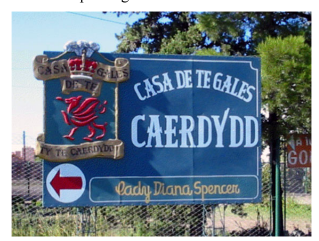
Figure 4. Tŷ Te Caerdydd advertisement in Gaiman, Chubut.

As a snap reaction to the kidnapping of a most lucrative aspect of their heritage, the owners of the 'genuine' Welsh tea houses decided to undertake a symbolic marking of their identity by creating the 'Círculo de casas de té de descendientes de galeses' (Figure 5) (an association pooling the efforts of tea house owners of Welsh descent) in order to guarantee the