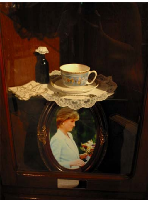
Figures 9-10. Showcase with the special crockery and table linen used on the day of the visit and detail of the cup from which she sipped and bottle with the rest of the tea left in her cup (on display in the tea house).

reproducing the romanticised tea ceremony as they would have experienced it at their original family home—and that is clearly not the case with the new tea house. After all, shouldn't the sweet treat be only an excuse to learn more about the wider culture and traditions of the little Celtic nation? How dare these outsiders set up a 'Welsh Tea House' if they are not even Welsh in the first place?