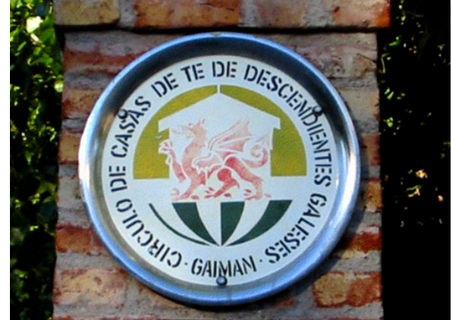
Figure 5. 'Círculo de casas de té de descendientes de galeses' plaque (Gaiman, Chubut).