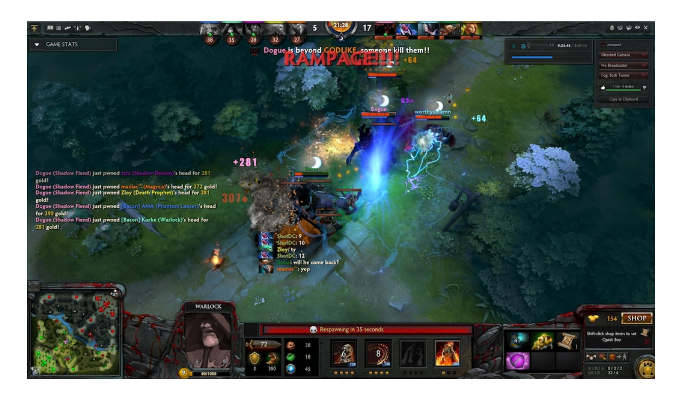
Figure 3 Valve's MOBA Dota 2

While the popular MOBA Defense of the Ancients 2 (Valve 2013-Present) freely offers all heroes for player adoption, other studios have crafted a new business model for the genre. Within this structure, players unlock heroes either by paying real-world money for them, or earning enough in-game currency through play to unlock them. The most notable game using this business model is Riot Games' League of Legends (2009-Present)<sup>3</sup>. Games like League of Legends alter the MOBA formula by restricting access to certain forms of gameplay. While players may slowly unlock characters by playing and saving their earned currency, the most immediate means of access occurs by purchasing them with real-world money. This model of paying to unlock content has spread throughout the computer game industry.