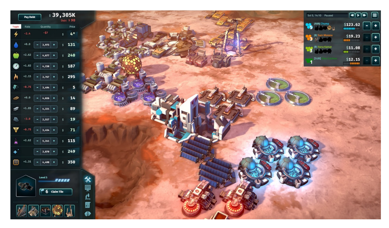
Figure 1 Offworld Trading Company

With this information in the interface (Figure 1), OTC encourages players to use the financial information on display and make decisions based on the position their opponents are taking in the market, rather than on the map. Moving the conflict of the strategy game from the map to an indication of market activity situates the main conflict of the game in the business arena. Most sessions and missions of OTC feature a similar pattern of resource collection, company development, and market manipulation. Players begin by acquiring natural resources from tiles near their headquarters, which they use to construct factories and produce commodities. Water, aluminum, iron, silicon, and carbon can be harvested, while power, chemicals, food, fuel, glass, oxygen, and steel must be produced. The game also allows players to buy and sell resources via the market accessed via the interface. As players engage in the market, it responds with fluctuating prices, which gives other players an opportunity to try to manipulate the prices of various resources.