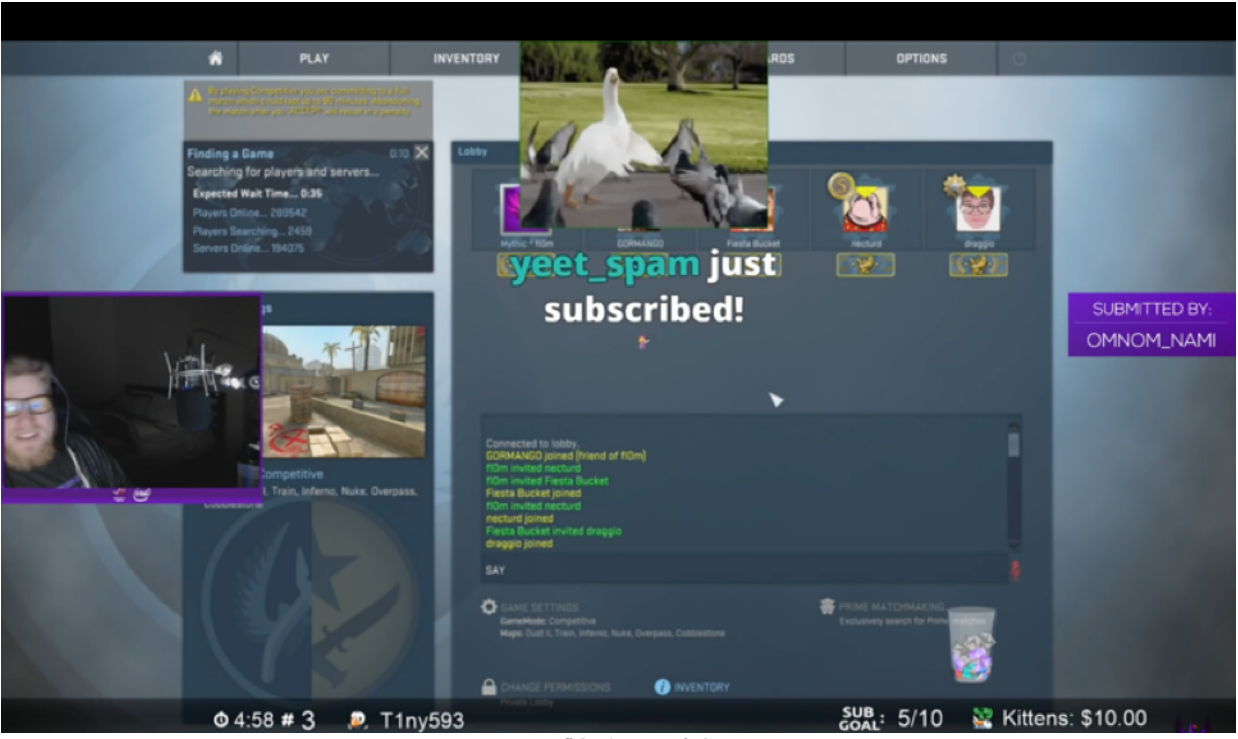
Figure 4 flOm's Twitch Stream

While there is no fixed visual arrangement for a Twitch presentation, a number of conventions have developed over the service's brief history, and the rhetoric of these interfaces