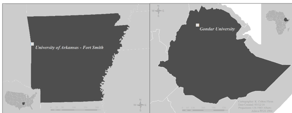
Figure 1. Location of the universities in Arkansas and Ethiopia that participated in the study. Cartographer: K. Colton Flynn.

This research employed a standardized geospatial learning activity at two universities in two distinct contexts, North America and Africa (Figure 1), to examine spatial thinking improvement on an international scale. The participating universities included the University of Arkansas-Fort Smith 1 (United States; UAFS) and Gondar University 2 (Ethiopia; GU). Established in 1928, and undergoing many higher education advancements since, UAFS (35.386°N, -94.373°W) currently serves ~7,000 students in 20 undergraduate programs and one graduate program ( www.uafs.edu ). GU (12.613°N, 37.450°E), established in 1954, currently serves ~22,000 undergraduates and ~2,000 graduates in 56 and 64 undergraduate and graduate programs, respectively ( www.uog.edu.et ). Both campuses are located on land exceeding 100 acres, serving as prime study areas for the geocaching activity.