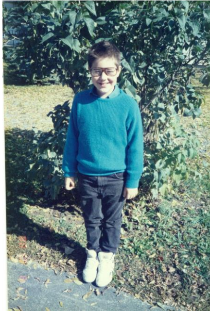
Figure 1: Photograph of Child

Let's try that once more from the beginning: in Metz's reckoning, the image above with no further contextualization is simply a paradigmatic/syntagmatic signification on the level of discourse. It has no "positional" contiguity because it has no sequence, but it has "spatio-temporal" contiguity to stand for formal evidence of Jakobson's linguistic combination and selection. 20 In other words, it displays formal elements chosen along lines of common theme and device that Sontag and Michaels theorize as a type of intermediate formal story: it's taken out-of-doors in adequate light, it maintains a predictable depth of field, the subject is centered in the photograph, carefully distanced from the background and foreground of the image, and the photographer has chosen a moment where the subject is smiling to take the snapshot. It may or may not have a discernable intrinsic narrative (first day of school?—new sneakers to show off?), but it displays discursive, if not referential contiguity. If I were to then, in Metz's reckoning of the cooperative function of story, say that