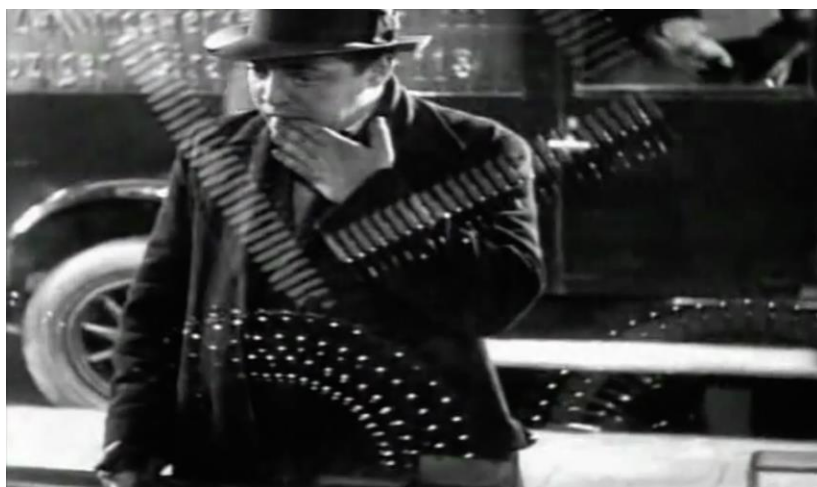
Figure 3: Visual metonymy, M , Fritz Lang, 1931.