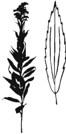
6. Late Goldenrod