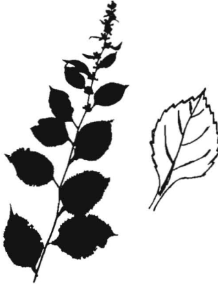
3. Zig-zag Goldenrod