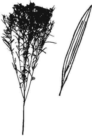
13. Grass-leaved Goldenrod