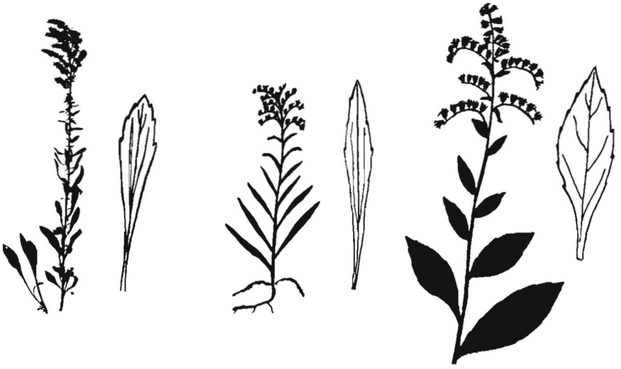
8. Old Field Goldenrod