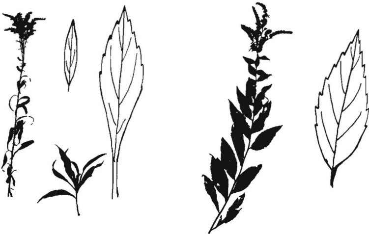
11. Early Goldenrod