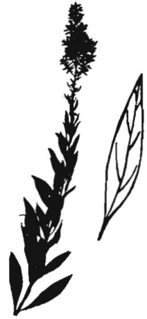
4. Showy Goldenrod