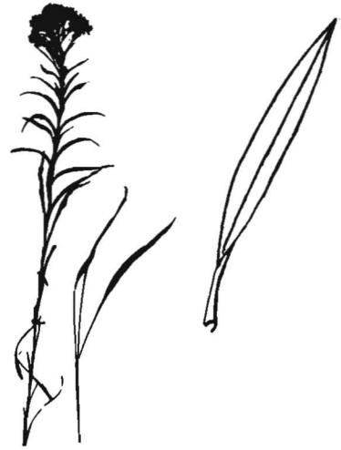
14. Riddell's Goldenrod