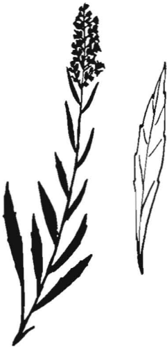
5. Swamp Goldenrod