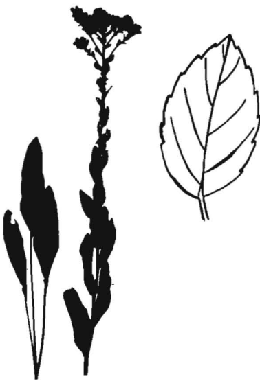
15. Rigid Goldenrod