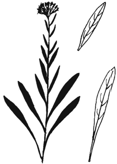
16. Ohio Goldenrod