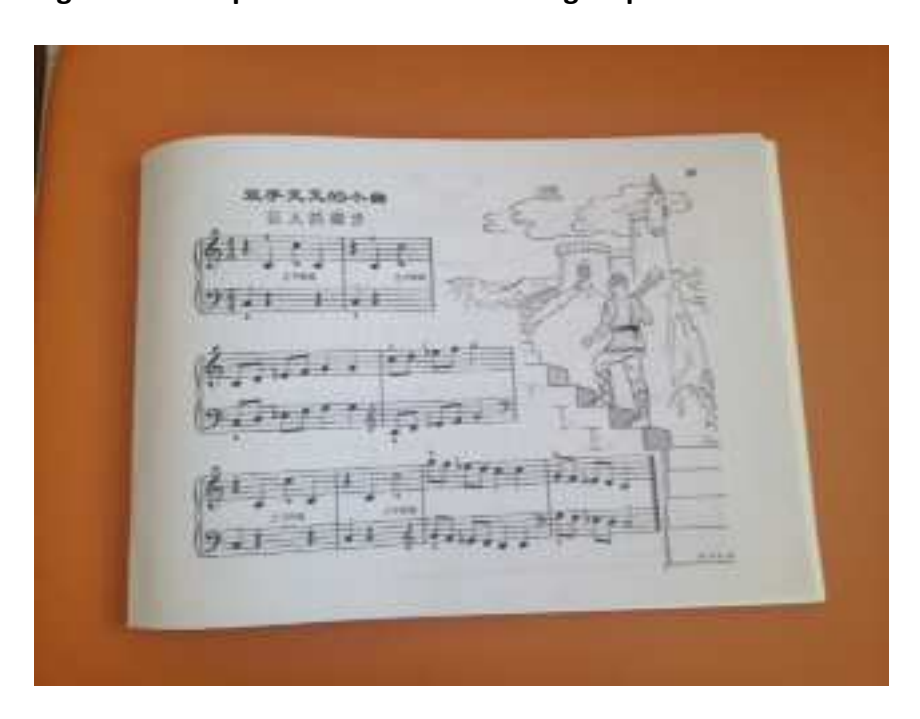
Figure 2. Thompson Book with ascending steps.

Other pages such as Figure 2 include pictures that indicate hand positions for students to learn/imitate.