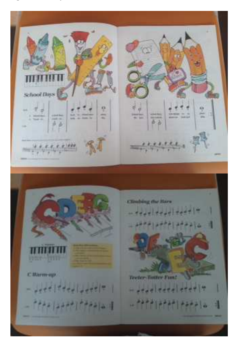
Figure 5. Examples of contoured notation not on the music staff

The same idea is found in each of the performance , piano and theory books. Compared to Thompson's , the similarity with Bastein is that some pieces also have piano accompaniment parts to play together with children (bottom of Figure 6). Bastein ,