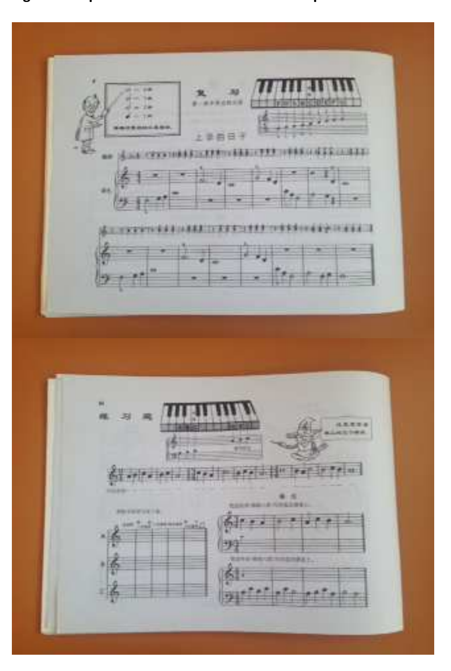
Figure 3. Representative material in the Thompson Chinese edition

Different musical pieces have different goals in the Thompson materials. Some are specifically designed for children to learn music techniques, for instance, what is middle C? or Where is it on the piano? (See Figure 3).