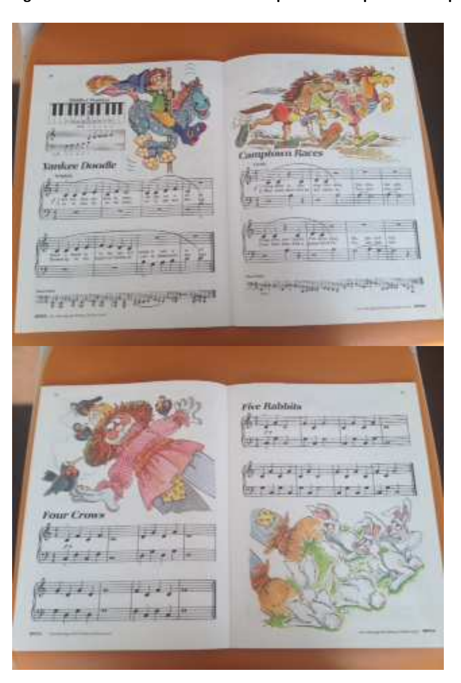
Figure 6. Bastein material with colorful pictures and piano accompaniment

however is more suitable for young children to use because it has more colorful pictures and the explanation parts are more specific for children to understand. The Chinese edition is also simply translated from the American edition without any changes to the materials in the book.