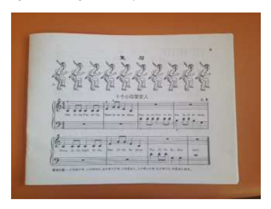
Figure 1. Basic Page from Thompson Book in Chinese

Other pages such as Figure 2 include pictures that indicate hand positions for students to learn/imitate.