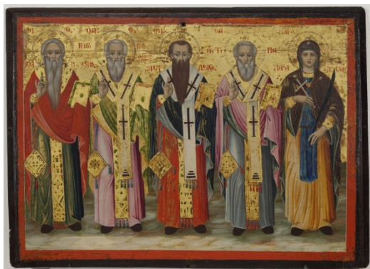
Figure 1. Saints Basil, John Chrysostom, Gregory, Athanasius, Parakevi. Greek, 18 th century. Rogers Family Collection in the UWM Art Collection. (1986.146)