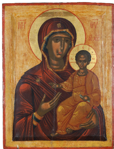
Figure 2. The Virgin and Christ Child (Hodegetria), Greek, 17 th century. Rogers Family Collection in the UWM Art Collection. (1983.056AH)