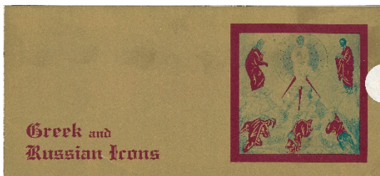
Figure 11. cover of the invitation for the opening reception of Greek and Russian Icons and other liturgical objects: 6 th -19 th centuries, 1965.