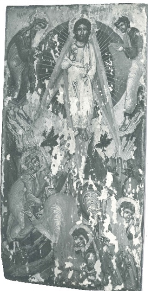
Figure 8. image of Transfiguration icon before restoration.