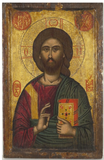
Figure 3. Pantokrator icon, Greek, 16 th century. Rogers Family Collection in the UWM Art Collection. (1983.040AH)