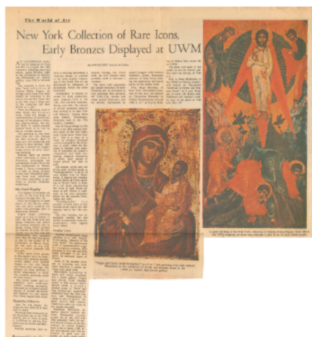
Figure 13. Greek and Russian Icons and other liturgical objects: 6 th -19 th centuries newspaper clipping, Milwaukee Journal Sentinel, 1965.