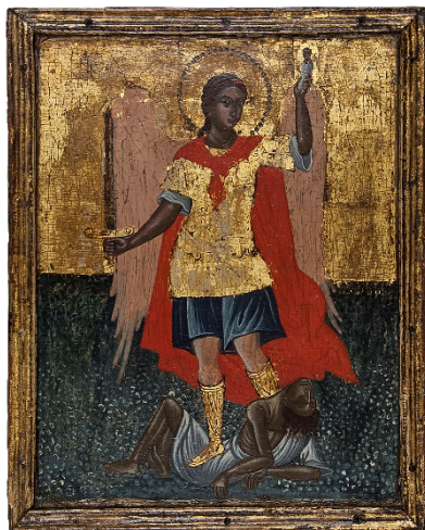
Figure 4. The Archangel Saint Michael Overcoming Lucifer, Greek, 17 th century, Rogers Family Collection in the UWM Art Collection. (1983.039AH)