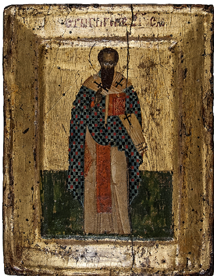
Figure 5. Saint Gregory the Theologian, Russian, 17 th century, Rogers Family Collection in the UWM Art Collection. (1986.140)