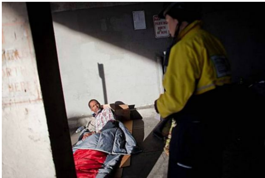
Photo source: Seattle Post-Intelligencer (Knight 2010), caption reads: “A safety ambassador with a nonprofit wakes up a homeless man and tells him to get up and move along. Photo: Mike Kane/Special To Seattlepi.com”

MID Safety Ambassador performing a wake-up call