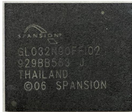
Figure 6. Flash Memory Chip

The devices each had a 4MB flash memory chip (Figure 6), and the extraction effort supplied both raw chip-off images as well as a copy where the byte order was reversed (RBO2). Data was extracted from both Vx610 devices.