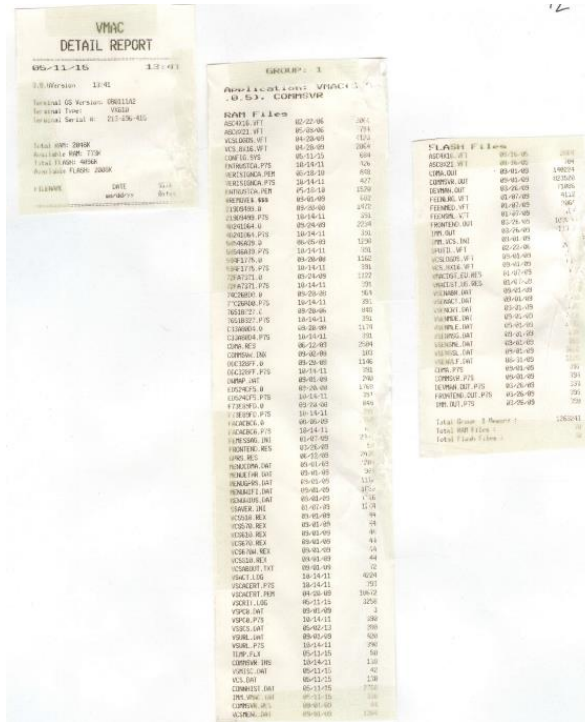
Figure 4. Partial VMAC Detail Report