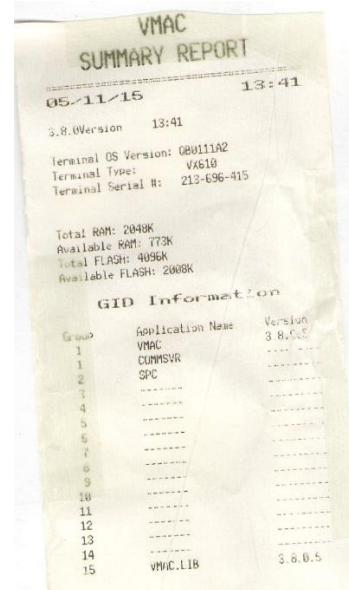
Figure 3. VMAC Summary Report