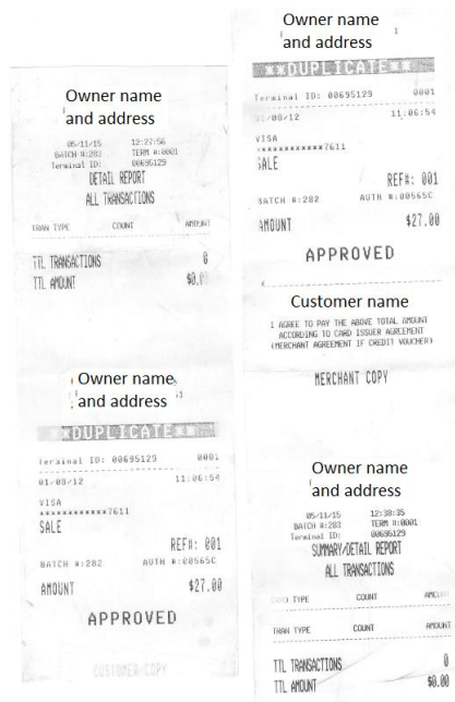
Figure 2. Last Transaction Report

and Ethernet ports, but the computer did not recognize that a device was connected. A wifi connection attempt also failed. This confirmed the entries on the VMAC detail report, which stated that Wifi and Ethernet were not supported on this terminal and the USB port was disabled.