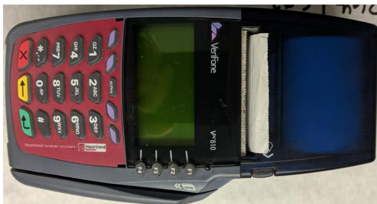
Figure 1. Verifone Vx610 POS device

only connected to process transactions in the evening. The Vx570 model was owned by a bakery. One of the Verifone Vx610 models used for this examination is shown in Figure 1.