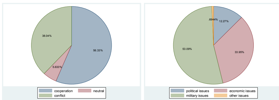
Figure 5.1. The conflict /cooperation and type of issues in the ROK –U.S. relations.

Figure 5.1 shows the percentage of conflict/cooperation and the type of issues in the relation between the U.S. and South Korea. As mentioned above, cooperative actions and military issues are more than 50 % of the overall actions in their relations.