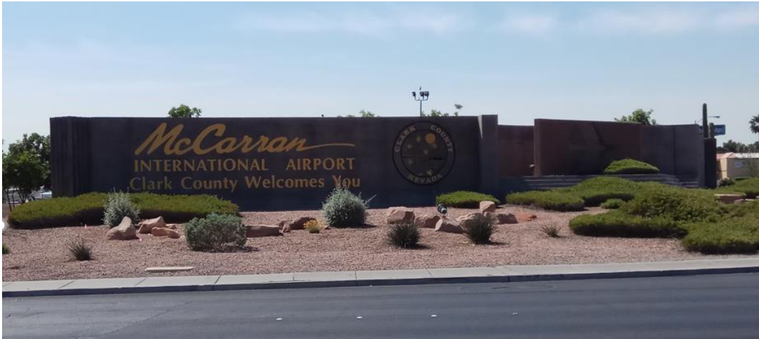
Photo 4.0 The McCarran Airport entrance sign.