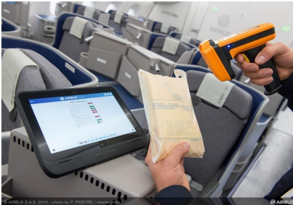
Photo 1.0 shows the RFID reader scanning a life vest package.

Permission granted to use photo for publication to IJAAA peer-reviewed journal at ERAU