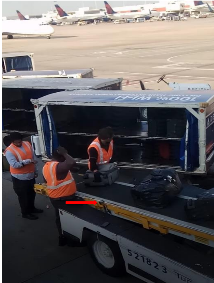
Photo 3.0 shows the mounted RFID readers with baggage handlers.

Red arrow points to the location of the mounted RFID reader. Read rate and belt speed vary by airport system configurations.