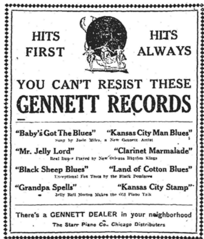
Figure 1. Advertisement for Gennett Records, Chicago Defender , October 20, 1923, 7.

Thus, even as the novel signals how it will distance itself from known blues geographies, Not Without Laughter evokes the actual artists, songs, and places of 1920s race records. Beyond these naming parallels, the two advertisements cited here were published in the Chicago Defender , a key player in the distribution of blues and jazz music which the novel explicitly mentions in episodes in Chicago and among several different parts of Stanton’s African American community. Within the novel and outside, the Defender ’s widespread availability draws attention to