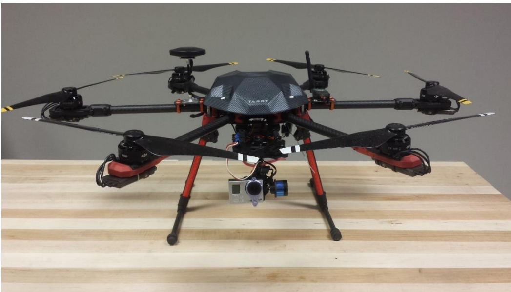
Figure 5. An example of a UAV with a gimbal mounted camera. This particular UAV is carrying a GoPro Hero3+ camera.

setup. Kite platforms' cameras typically hang from the kite line, not the kite itself, while some blimp models allow for the camera to be hung from the underside of the blimp as opposed to the line. Many tethered approaches require user customization in regards to imaging sensors. Some blimp manufacturers offer all-in-one packages, but others sell only the blimp sans camera. For kites, the closest thing to a complete package are kits to build camera rigs, but these all require customization to accommodate the specific camera used. Figure 6 shows an example of a kit-built camera rig that can be connected to a kite line or blimp that was customized to mount a specific camera and shutter trigger mechanism.