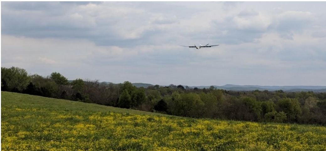
Figure 1. A fixed-wing UAV on final approach to land.

In comparing the different SFAP platforms, there are various practical factors of their operation that must be considered. Some of these are physical factors, such as the capabilities and limitations of the lifting mechanism. Others relate to environmental factors like atmospheric conditions and the suitability of local sites for operation. In addition to these, imaging sensor options, hardware and continuing operation costs, and regulatory factors that affect how and where SFAP platforms can be legally operated are covered. While SFAP can be collected worldwide, the authors have the most experience collecting imagery within the United States, and the bulk of the regulatory discussion will focus on United States Federal Aviation Administration (FAA) regulations.