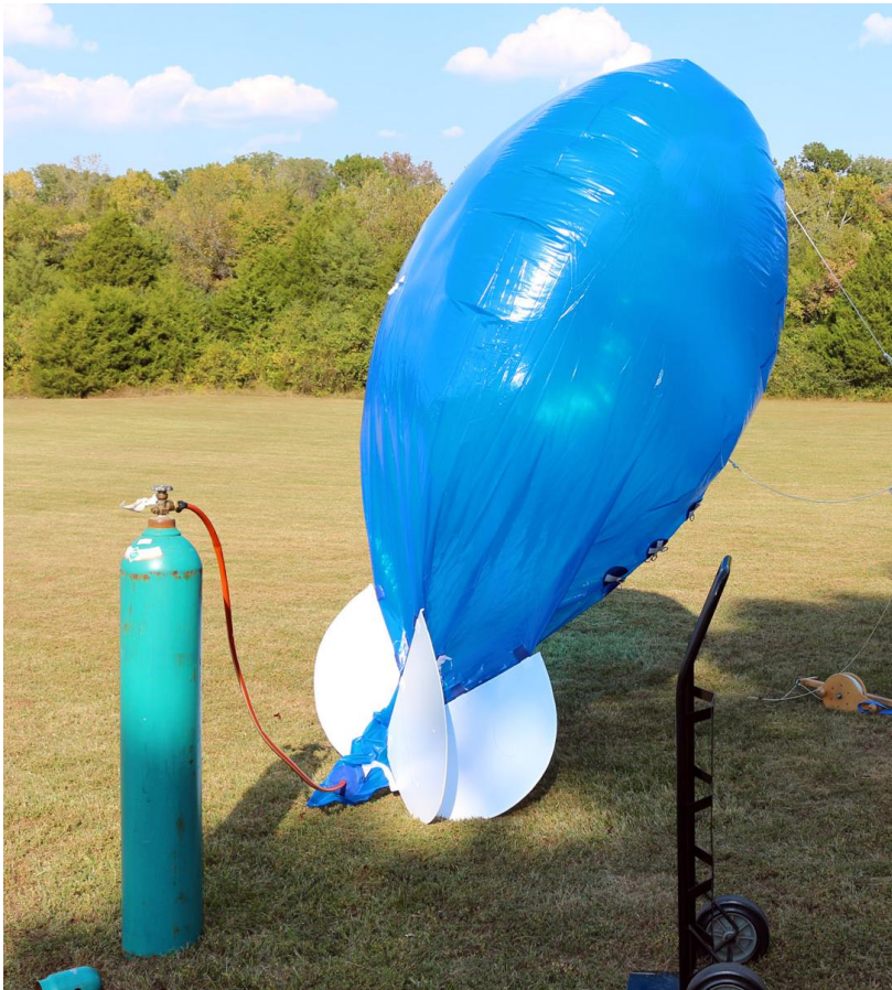
Figure 4. An example of a helium blimp being inflated before flight. When full, this particular blimp is thirteen feet in length (just under four meters) and holds approximately 300 cubic feet of helium (eight and a half cubic meters).

All UAV platforms are essentially miniaturized versions of larger mechanized flight platforms, namely fixed-wing airplanes and multi-rotor helicopters. As such, the principles of flight are the same, only at a smaller scale. Typically, these smaller UAV versions are powered either by batteries connected to electric motors, or liquid fuels used to power small combustion engines. Fixed-wing designs have flight characteristics similar to human-scale airplanes and work well for flying long, sweeping paths across a site to collect images. Multi-rotor UAV platforms are much more maneuverable, many of them capable of taking highly irregular flight paths if necessary, as well as being capable of flying in constrained environments.