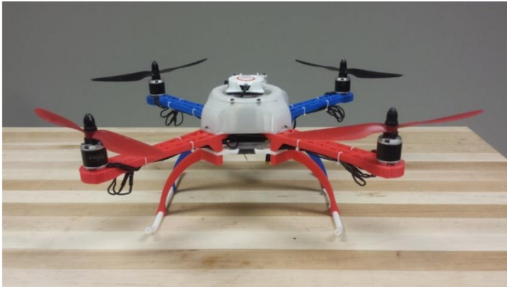
Figure 2. An example of multi-rotor UAV, in this case, a quad-copter.