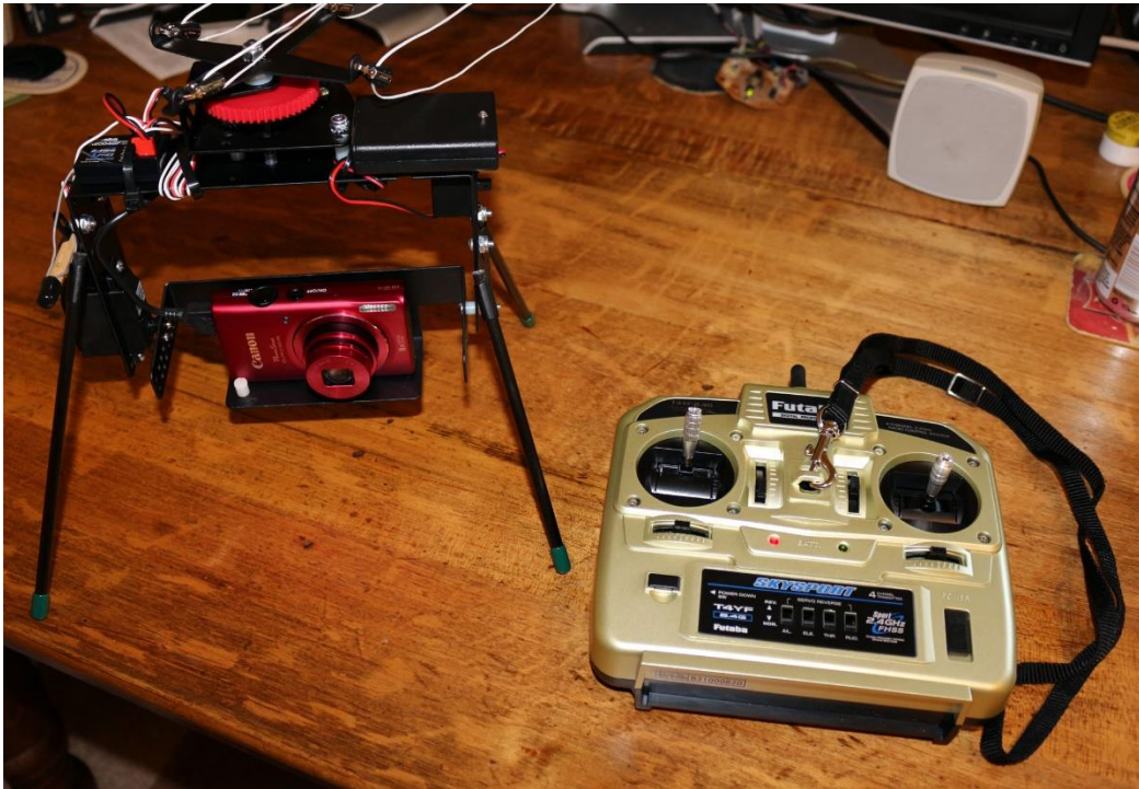
Figure 6. An example of a customized kit-built remote camera rig carrying a Canon PowerShot ELPH 130IS for use with tethered platforms.

shutter mechanism. Some camera systems allow for continuous shooting or shooting at a defined interval. Embedded UAV systems may also offer similar options to users for automated or manual image collection. Whether the shutter is controlled from the ground or set to run automatically is up to the user and the needs of the specific application, and the options available are more or less consistent across all lifting platforms.