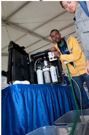
Figure 2 P3 Phase I Prototype Demonstration

The team started the project by defining design requirements and went through the design stages including conceptual design, detailed design, and prototype development. By April 2012, the team completed the prototype design as shown in Figure 2.