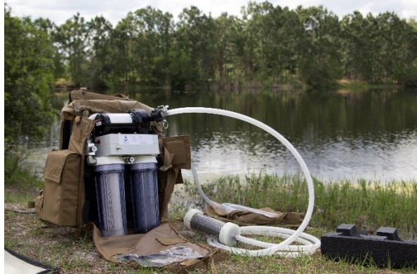
Figure 3 Final Product of Phase II

Since the competition, the co-founders have adopted the lean methodology to create a business model canvas and getting out of the building to validate the model. To do this, the team has gone to multiple trade shows and conferences to network, get feedback, and generate sales. The team has also developed relationships with lawyers, suppliers, shippers, and other people contributing to the success and growth of AquaSolve. Having the ability to say that the product was developed using funds from the EPA and was developed while in school has helped in developing these relationships. Many people have offered their help and suggestions because AquaSolve's vision of helping to solve the global water crisis is a good story and there is potential in the business.