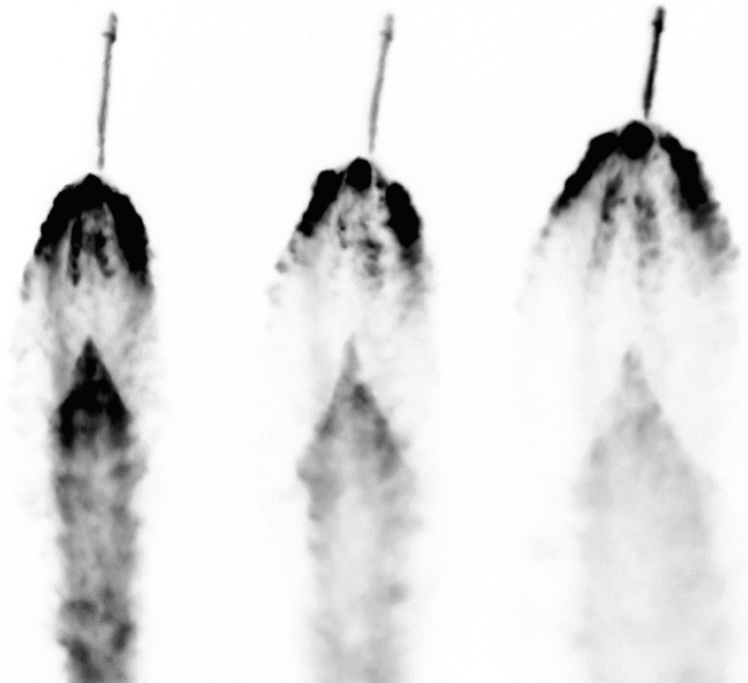
Figure 4. Shows three inverted images of the Falcon 9 launch vehicle, acquired on March 30, 2017. These images were acquired from the veranda of the College of Arts and Sciences building at Embry-Riddle's Daytona Beach campus, over 150 km (90 miles) away from the rocket's launch site.

Development towards a more efficient tracking system has produced a more sophisticated tracking program that enables faster searching of observable satellites over a given observation site and time window. The modularization of the mount communication protocols and commands will enable easier integration of future TCP/IP based telescope mounts while a GUI based