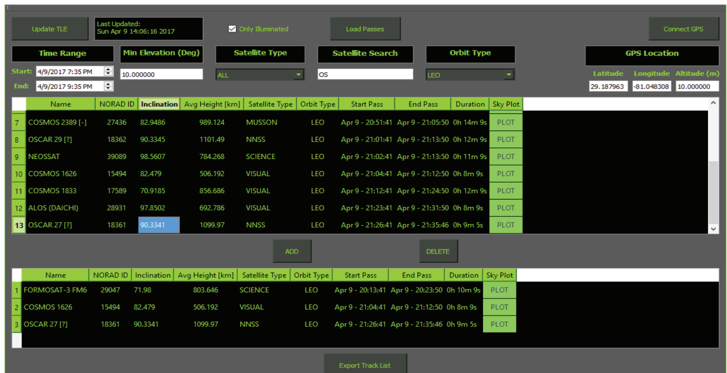
Figure 2. Shows the program for selecting satellites to observe. Satellites for specific classes such as CubeSats can be shown only. The user also has the option to change the location of the observation site and the observing time window. The top list is the satellites that the user can choose from while the bottom list contains the satellites the user has selected to observe.

For the new version of Auriga, SGP4 was used not just for the actual tracking of satellites, but was also used to predict all available satellite passes for a given observation date and time range. This addition to Auriga prevented the need for the user to manually search for available passes on databases such as Celestrak and Heavens Above. Separate from the tracking software, observers can now search for satellite passes based off the class of the satellite, science, CubeSat, and military. Other search parameters are available such as the orbit type, low, medium or geostationary orbits, the maximum elevation the satellite passes over the local horizon, and whether the satellite is illuminated by the sun. Since the latter is required in order for it to be visible, this parameter is always active. This program obtains the satellite TLEs from Celestrak and uses SGP4 to determine which satellites pass over the observation site at the maximum