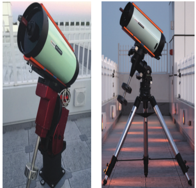
Software Bisque Paramount Losmandy with Gemini 2 Figure 1. Shows the telescope mounts that the OSCOM system currently supports.

Despite OSCOM's current capabilities, there is ongoing improvement towards a more sensitive system that can track and analyze data automatically with little user assistance. There are various areas of