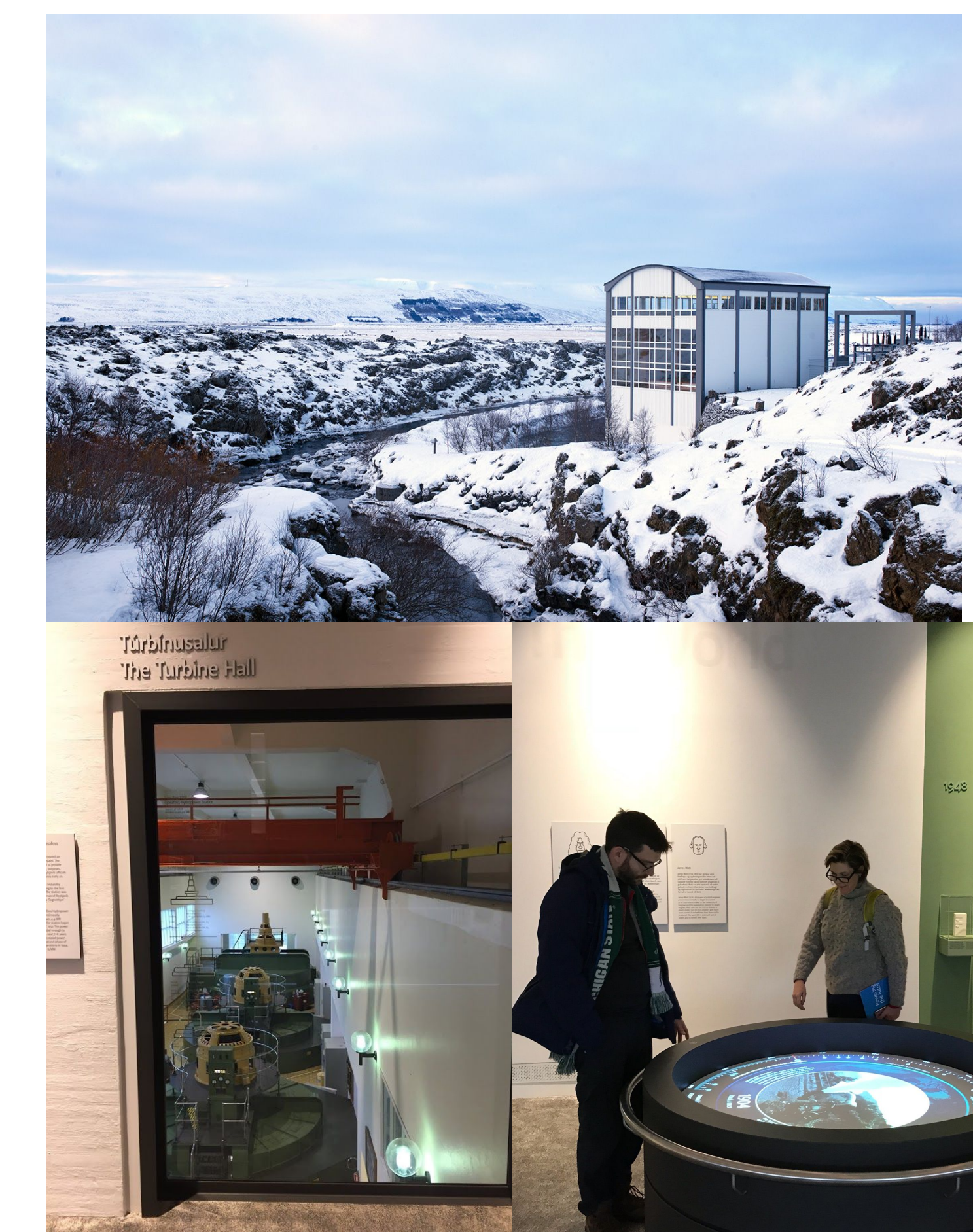
Photos 7-9: The Ljósafossvirkjun Hydroelectric Power Station contained exhibits that were interactive, and promoted the history of clean energy throughout the world, and Iceland.