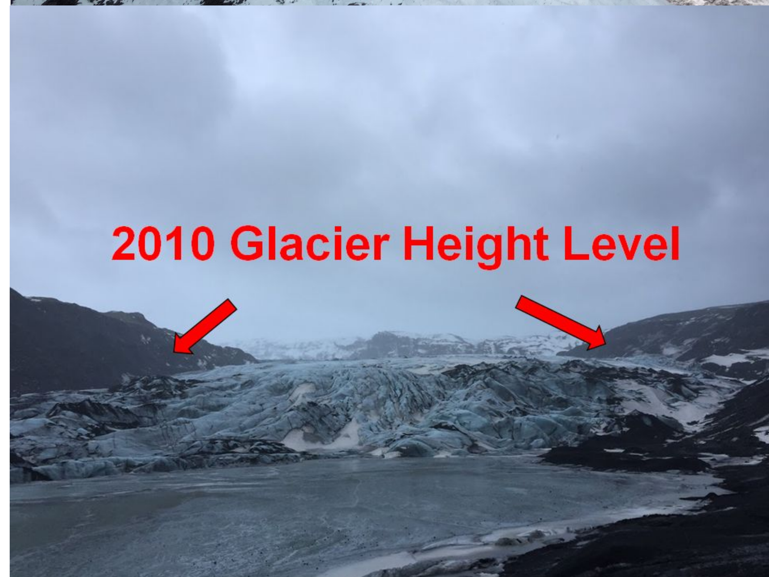
Photo 2 & 3: The photos above indicate the position of the Sólheimajökull glacier in Southern Iceland back in 2010, versus 2018.