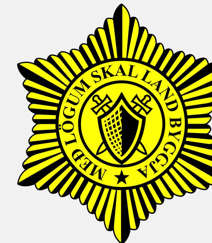
Figure 1: Insignia of Icelandic Police