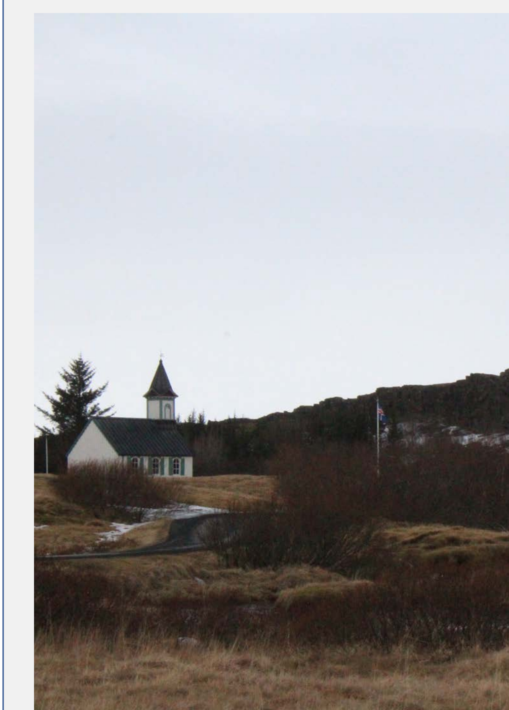
Picture 3: Church with the Icelandic flag near where ancient Viking congress was held

Iceland has enjoyed a certain air of peace and calmness across the nation for nearly 1000 years, a cultural time capsule left behind by the Vikings. The Icelanders are only determined to continue their peaceful interactions amongst themselves and others. Both by continuing the egalitarian culture they have created with very little disparity between people and seeking to help criminals and provide other means for survival. Violent crime in Iceland is almost exclusively confined to the underground criminal rings that run drugs, but even with the presence of drug trafficking, drug use in Iceland is incredibly low as well. On the subject of tourism and immigration, it appears that an observable effect has not surfaced outside of increased speeding offences. Although this was the findings, Iceland's tourism industry continues to expand, so a lasting effect of tourism and immigration may still be developing.