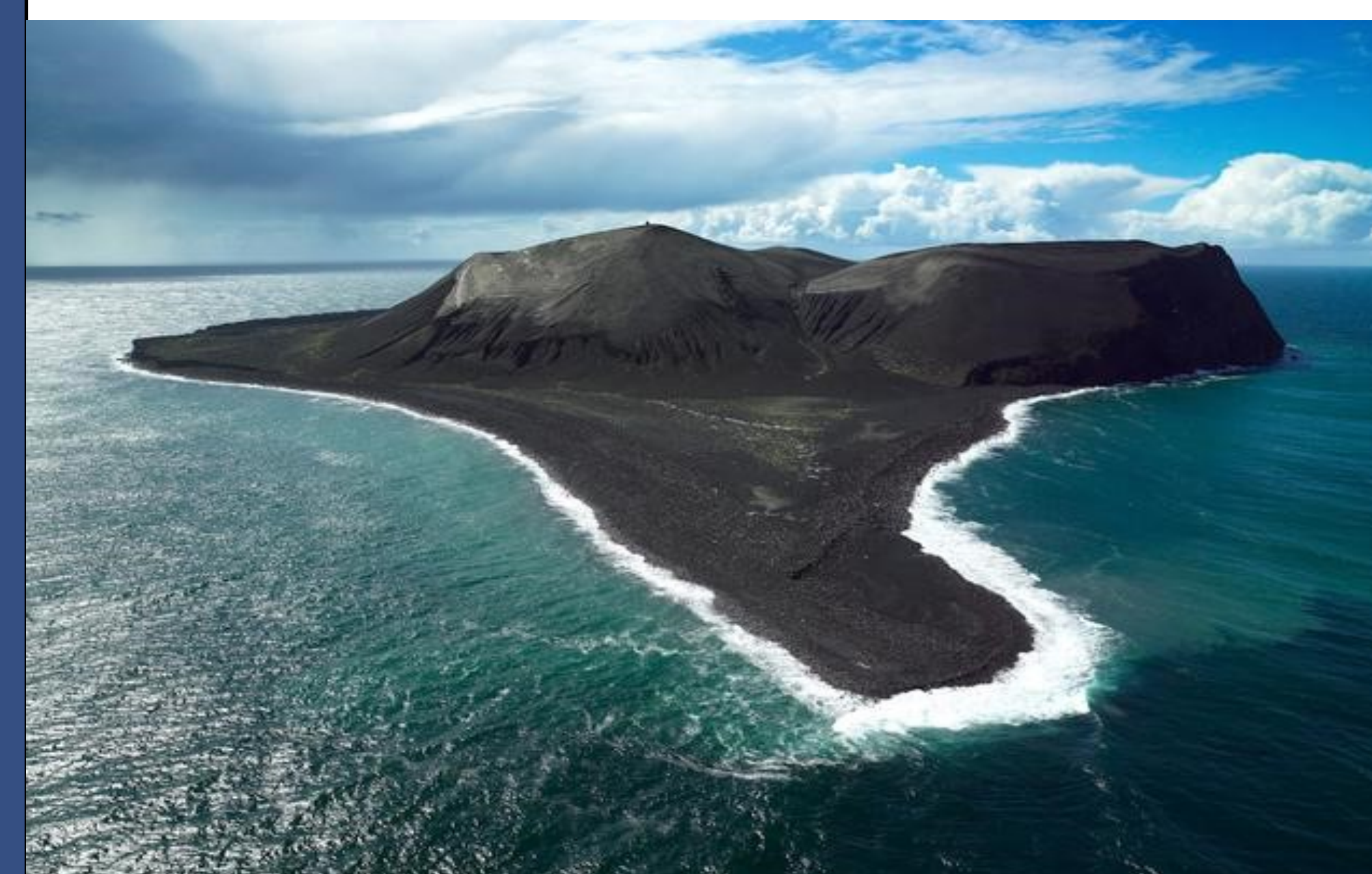
Figure 2: Surtsey island(1963-1967) 3