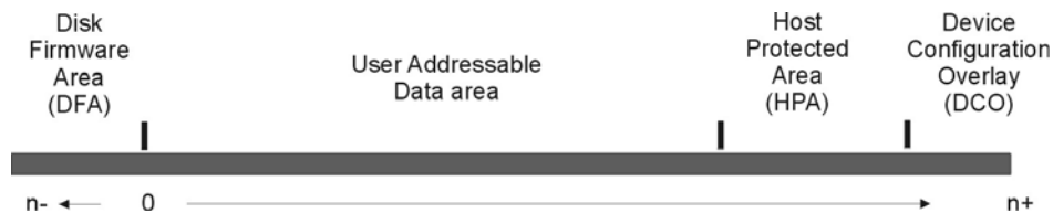
Figure 1. Overview of Disk Areas

Not all areas of the disk are addressable by the host computers operating system. In addition to the user addressable space there are areas of the drive that are used for the manufacturer to record data and perform diagnostics. These include the Host Protected Area (HPA) and Device Configuration Overlay (DCO), either or both of which can exist on a hard disk [1], [2] and in addition to this the firmware areas, which exist in the lower range of the address space, sometimes referenced by negative numbers (see Fig.1 below).