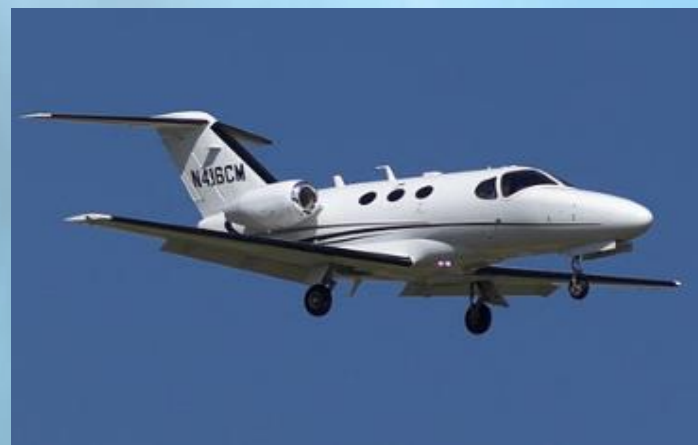
Cessna Mustang 510