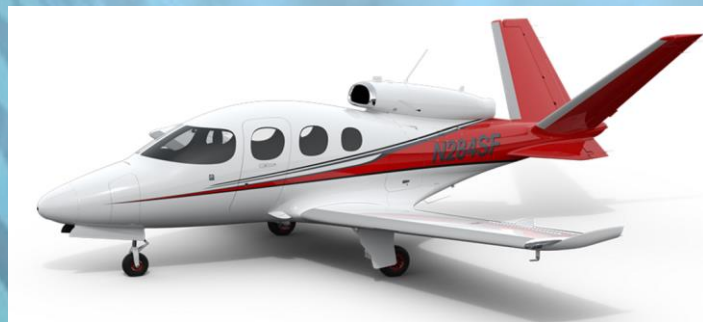
Cirrus SF 50 Vision Jet