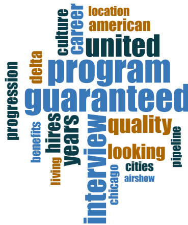
Figure 4. Approaches that are working well to attract pilots.

As a follow up question, participants were asked to identify the biggest challenges to attracting pilots to the airline. The primary response, noted by half of the participants, was that there are simply not enough qualified pilots in the pool. The comments centered on the tough competition between regional carriers for the “best and brightest.” Additional topics raised included the need to educate those coming into the industry, especially youth, about career opportunities. Other identified hindrances to attracting pilots were lack of desirable base location and lack of a career progression path to majors.