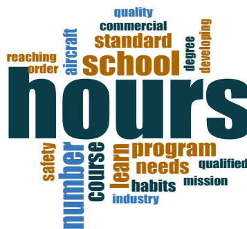
Figure 5. Desired industry changes to attract more pilots.