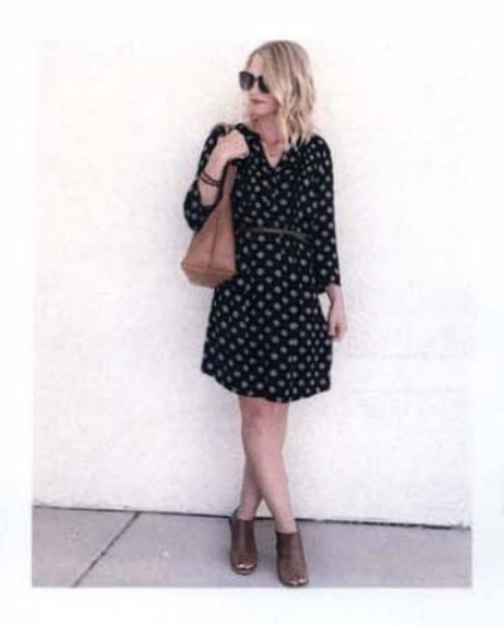
I think one of the coolest things about sharing your passions on any platform is having the oppartunity to network and connect with other prophe who also value the same frings you value. Nin Ki I's so cool that everyone shares their own Infe fashion diary, and wa're able to uppert and be interpred by each other's earten't. So in the sprin of the halidary, here's my gift to you. Here are my favories firth style fashion bioggins at the names, and I hape these women are able to inspire you the way hery hare name and I labor to view their accounce) Happy Network.