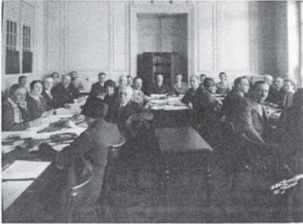
Figure 1: "Advisory Commission on Social Questions" League of Nations Online Archive: Indiana University Bloomington. http://www.indiana.edu/~libresd/nt/db.cgi?db=ig&do=search_results&details=2&ID=193&ID-opt== .