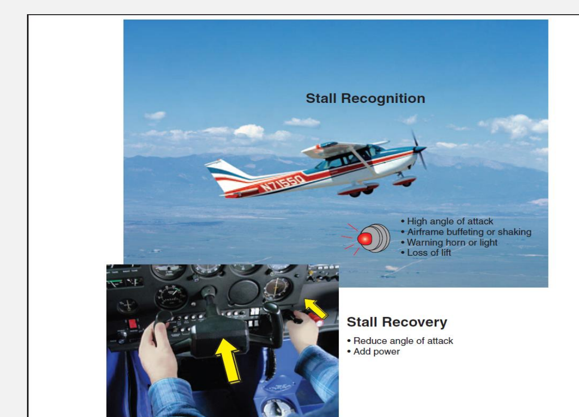
Fig. 2 – Stall Warnings 1