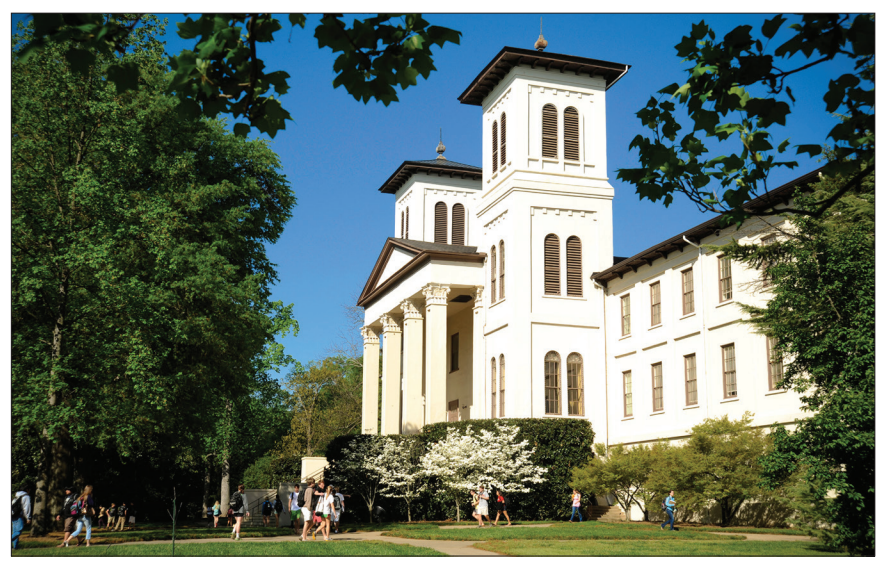
Main Building, 1854