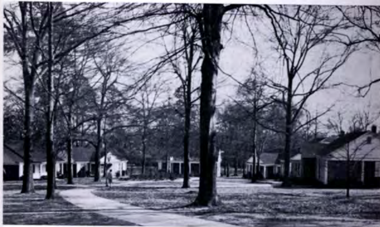
Fraternity Row— seven national fraternities