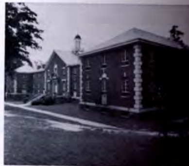
Green Hall— dormitory