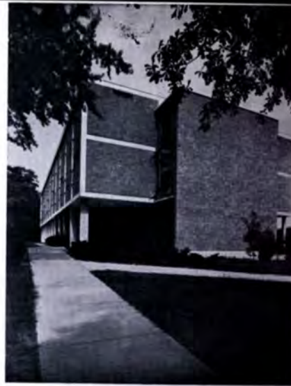
Milliken Science Building—