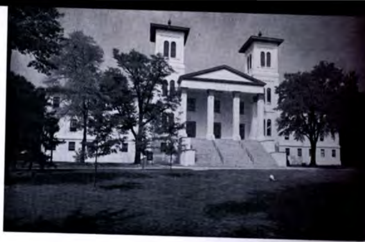
Main Building— classrooms, faculty offices, auditorium, chapel