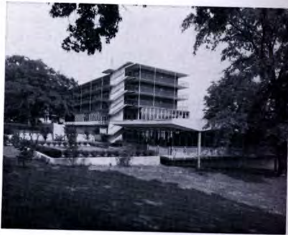
Wightman Hall— dormitory, cafeteria, canteen