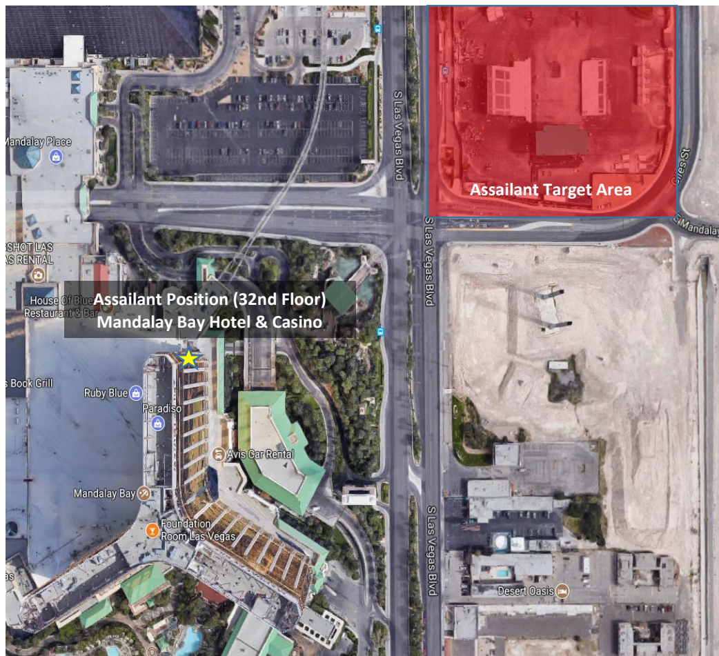
Figure 1. Google Maps display of assailant position and target area.

Succinctly, the assailant carefully planned and executed a lethal, indiscriminate firearm attack from a semi-anonymous, protected and elevated position on a densely-packed crowd of unsuspecting victims in an open field at night. He was equipped with highly-capable, modified armaments designed to inflict maximum damage and was prepared to engage in a prolonged and sustained attack. He was fully prepared to counter, engage, or repel law enforcement tactical efforts to subdue him through electronic monitoring and brute firepower.