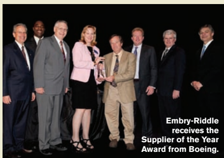
Embry-Riddle receives the Supplier of the Year Award from Boeing.