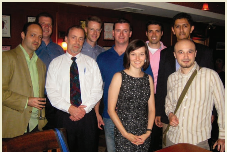
From top to bottom: Alumni Chapter members in Prescott, New York City and Daytona Beach.