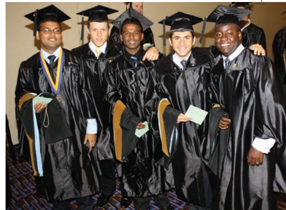
In early May, graduates at all Embry-Riddle campuses celebrated commencement.