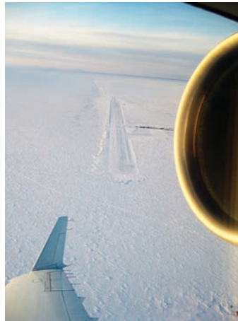
Liz Smart endures brutally low temperatures to keep Antarctic airfields, including Pegasus Skiway/Runway complex, safe for the 6,500 passengers and 1.5 million pounds of cargo that land on the runways each year.

As if the freezing climate weren’t enough, Smart also has had her share of wildlife encounters on the