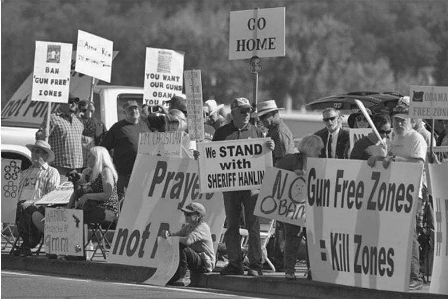
Fig. 2. Gun-rights activists greeting President Obama after the shooting at Umpqua Community College in Roseburg, Oregon. 15

Such definitional ambiguity makes it difficult to determine whether there are distinctive markers of social activism and social activists, and how these markers might helpfully differentiate social activism from other advocacy or change-focused entities and initiatives. 16 For the purpose of this article, however, a broad definition—“people coming together to change society”—works well because it enables us to envision how dispute systems design might be relevant to a wide variety of initiatives and campaigns.