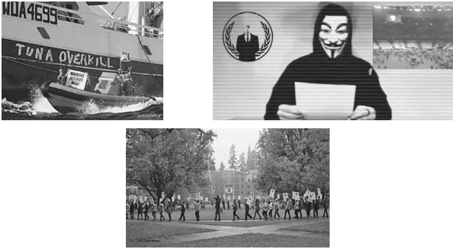
Fig. 1. Greenpeace activists vandalizing a fishing vessel; hacktivist collective Anonymous declaring techno-war on ISIS after the Paris terror attacks; peaceful protest by Oregon graduate students. Are these forms of negotiation, or conflict management, or self-determination, or participatory process, or normative leverage, or some other recognizable ADR mechanism? 5

What's interesting about this uncertainty around how activism and ADR fit together is that ADR itself has activist roots. Early proponents of modern ADR were striving for nothing less than real access to justice and high-quality dispute resolution by way of social transformation (extralegal services) and individual empowerment (self-determination). 6 They were optimists and innovators who believed real change was achievable, extolling the importance of consensus, continual improvement, and authentic engagement. 7 To this day, the field of ADR resonates with the idealism and passion of these early activists. 8