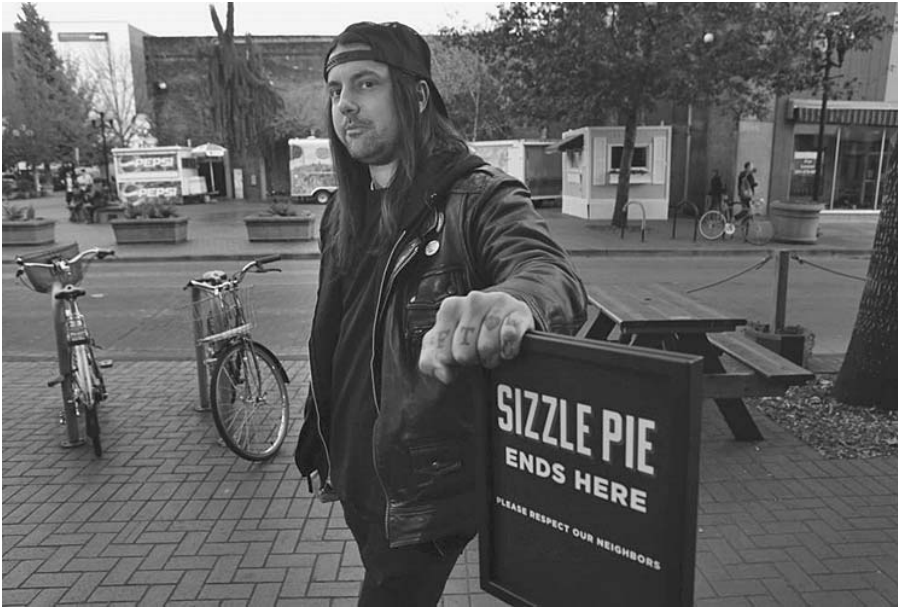
Fig. 4. The owner of Sizzle Pie in Eugene, Oregon, standing next to a sign attempting to demarcate the space in which the homeless are not welcome. Across the street is Kelsey Square, a public area in which many homeless people and others gather. 35

From the perspective of DSD, this sign provides a remarkable example of how stakeholder interests shape systems. The potential stakeholders around the issue of what to do with the sidewalk in front of Sizzle Pie include Sizzle Pie itself, other local businesses, the homeless and others who are in the area but not purchasing anything (“loiterers”), homeless activists, business supporters, patrons of Sizzle Pie and neighboring businesses, businesses in other parts of Eugene, and members of the public generally. It is easy to imagine that these various stakeholders will have different priorities when it comes to the sidewalk outside Sizzle Pie, and this sign (a design element that embodies the city’s sidewalk permit rule) may be seen as an effort to address these divergent interests.