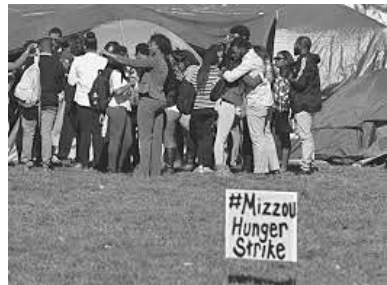
Fig. 5. Masked protestors; University of Missouri hunger strike. What makes a person become an activist? What could make that activist more effective? What assumptions are implicit in asking these questions? 39

Experienced activists have written guides and developed training that are wonderfully helpful, practical tools for both new and seasoned activi-