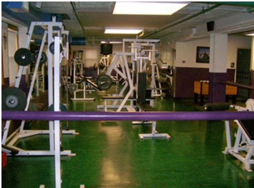
Figure 14. Weightlifting area in Teen Center

The lower level of the second building is a youth center. This center has pool tables, an electronic gaming area, and a workout area complete with weight lifting equipment. This area, similar to the child care center above, is kept clean and orderly. There is a feel of structured enjoyment in these areas. The activities available are similar to any other youth center. The rarity is that this facility is available with no governmental support, and the structure provides for a safe, low stress environment for teens that have a significant need of this type of environment.