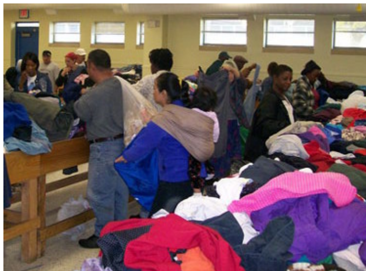
Figure 8. Clothing distribution area – Sharing and Caring Hand

The lower level of the main building is used for distribution of food and clothing which has been donated to Sharing and Caring Hands. Every day there are truckloads of food and clothing that come in on the docks. And every day this same food and clothing is distributed out to people in need. The clothing that comes in during the morning is spread out on large tables. After the lunch is served upstairs, the lower level is opened for people to come down and help themselves to donated food and clothing. There is no monitoring of the inflow or outflow of goods. What comes in, goes right back out. It just goes to different people. Again, the traffic is orderly and calm for the most part. At the first sign of disorderly behavior, one of the very large security guards yells something to the effect of “calm down or we will need to close for the day,” which instantly calms the situation.