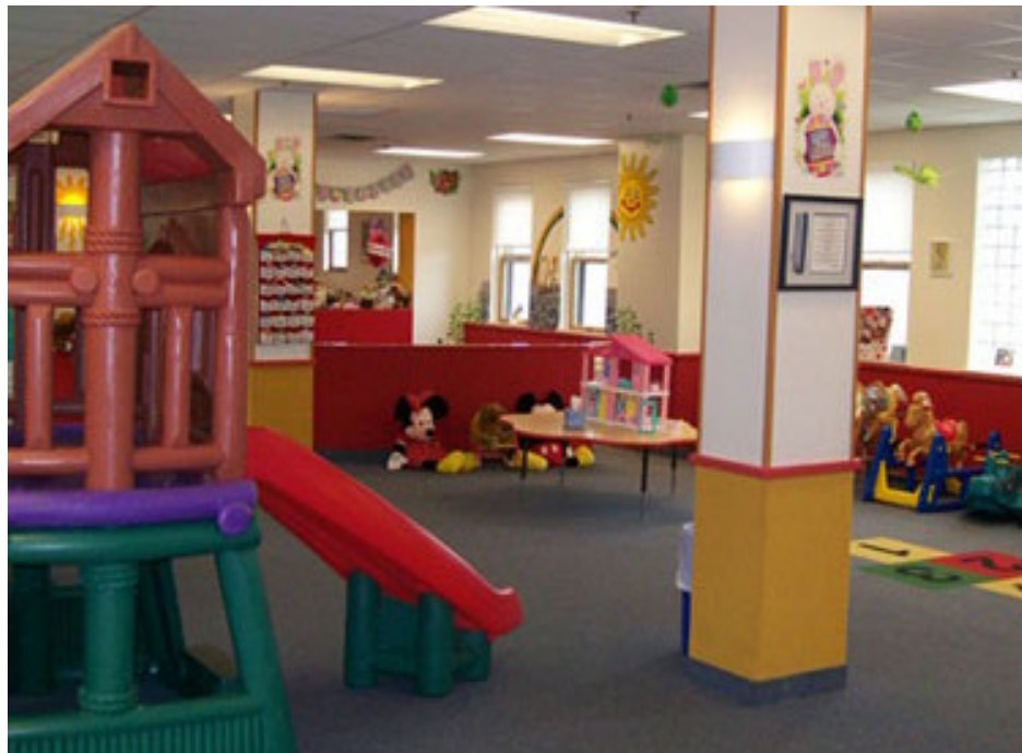
Figure 13. Daycare Center at Sharing and Caring Hands