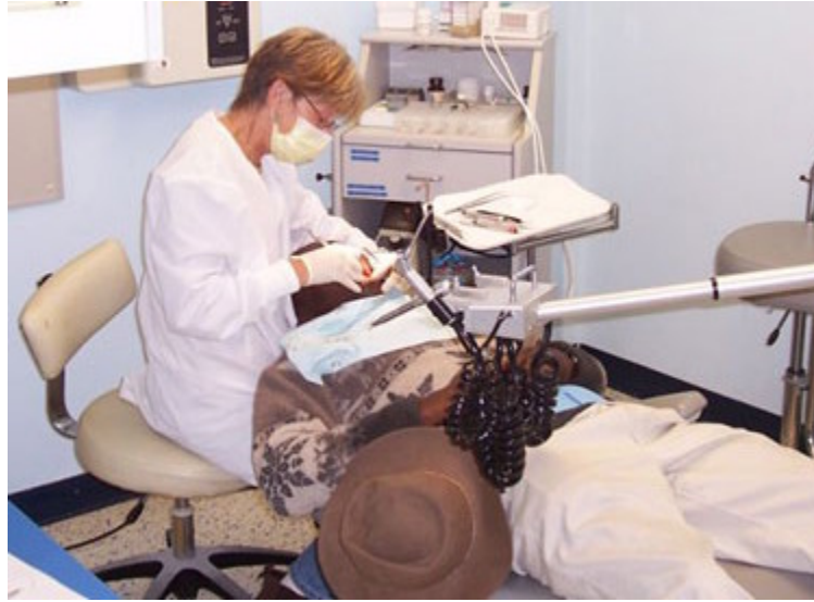
Figure 11. Dental services at Sharing and Caring Hands

The second building on the Sharing and Caring Hands campus houses a child care center, and a youth center. The upper level of this building consists of a child care center, which is free to the residents of Mary's Place. The child care center is similar to any day care center. There are separate areas for various age groups and each area is filled to the brim with age appropriate toys and activities. Again, the immediately striking aspect of the environment is the cleanliness of the facility. Everything is kept orderly and washed down on a daily basis. The interior of the facility appears as though it could be a child care center that exists in any suburban neighborhood.