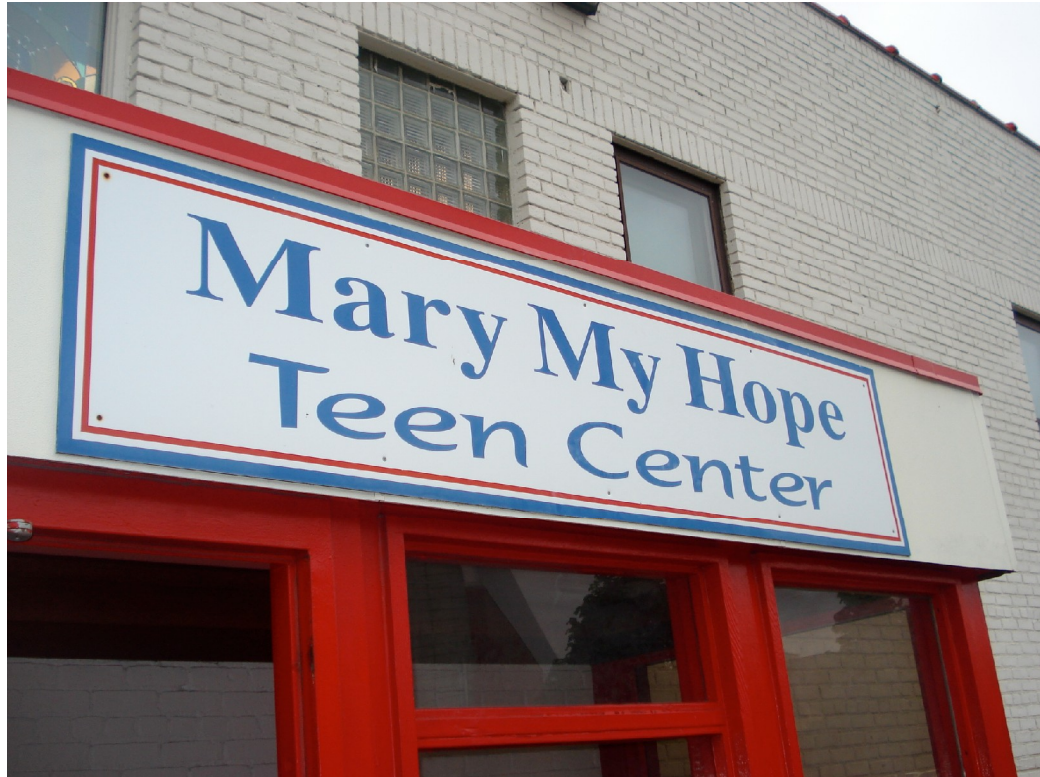
Figure 12. Outside of Teen Center at Sharing and Caring Hands