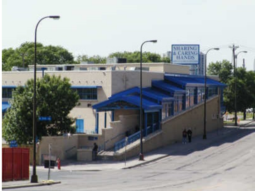
Figure 2 . Sharing and Caring Hands as seen from North Seventh Street, Minneapolis, Minnesota.