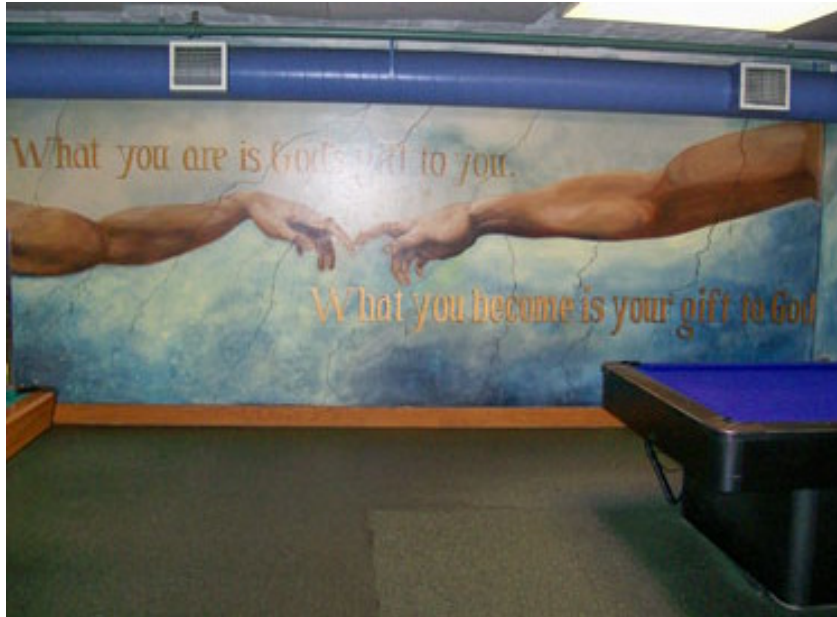
Figure 15. Mural on wall as you walk in to the teen center

The third building on the Sharing and Caring Hands campus is the transitional residence, Mary's Place. The residence contains 92 apartment style living facilities of various sizes. The apartments are one, two, and three bedroom units that are fully furnished and ready for occupancy. The rooms are ready for someone to move in with simply the clothes on their back – and that is exactly what happens on a frequent basis. The facility houses approximately three hundred and seventy-five people on most nights. The residents generally stay in this facility for a few months – some as few as two months, others as many as eighteen months.