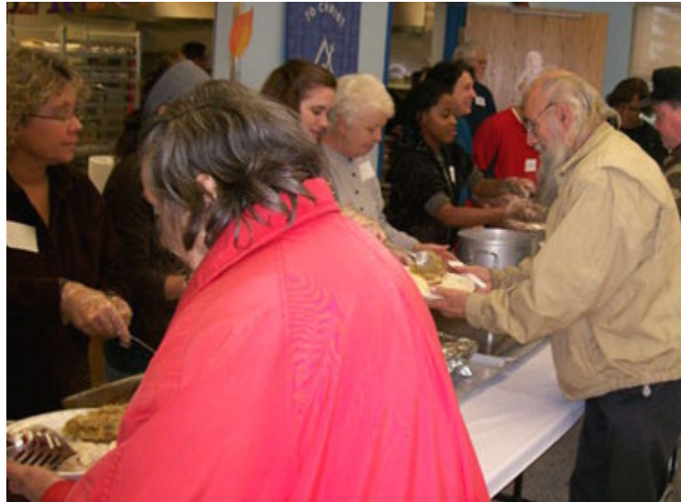
Figure 4. Lunch line at Sharing and Caring Hands

are omnipresent, but not overpowering. Other artwork in the cafeteria includes Native American art and a calendar of upcoming events.