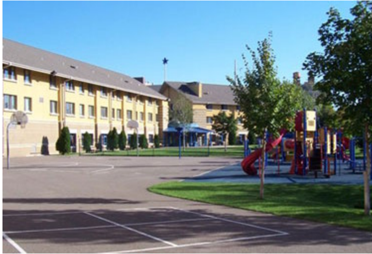
Figure 18. Children's play area outside of Mary's Place

The security system and presence at Mary's Place is substantial. The entrance is controlled via one locked door that a security person must engage to allow the door to open. All other windows and doors are closed to entrance. Further, there are security cameras in nearly all common areas which are monitored constantly by the security staff. Access to the facility is very secure during all hours of the day and night.