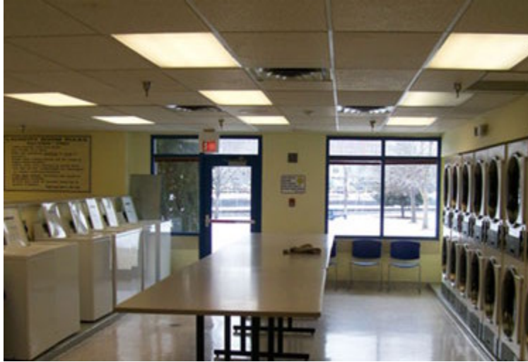
Figure 17. Laundry facility at Mary's Place