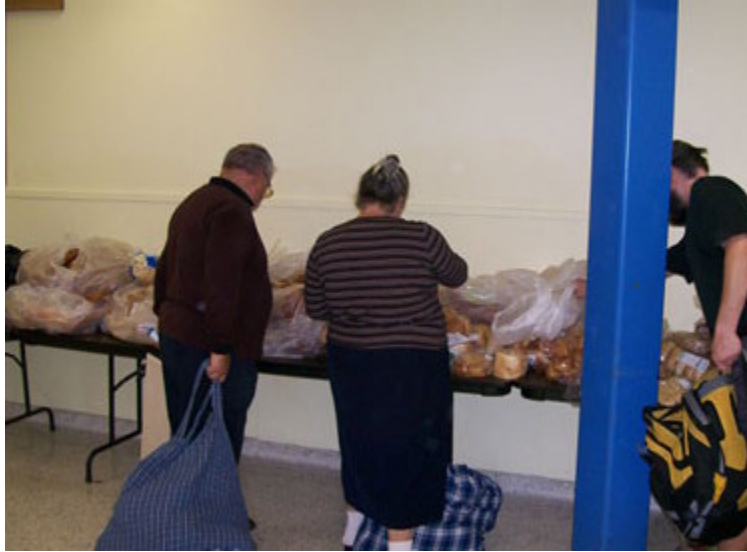
Figure 9. Food shelf distribution – Sharing and Caring Hands