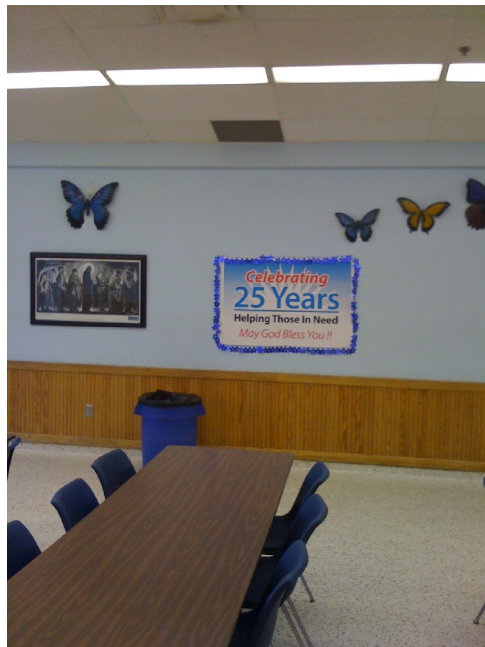
Figure 5. Cafeteria at Sharing and Caring Hands