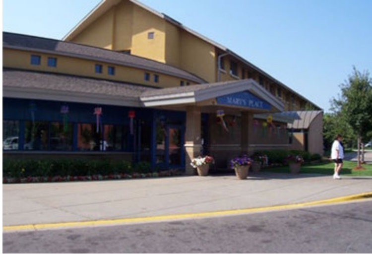
Figure 16. Mary's Place transitional residence

Mary's Place also contains a laundry facility, computers available for the residents, and a prayer chapel. There are also counseling rooms and education rooms located within Mary's Place. Many residents use the computers for updating resumes and conducting job and apartment searches. Residents are expected to be continually working to improve their current station in life.