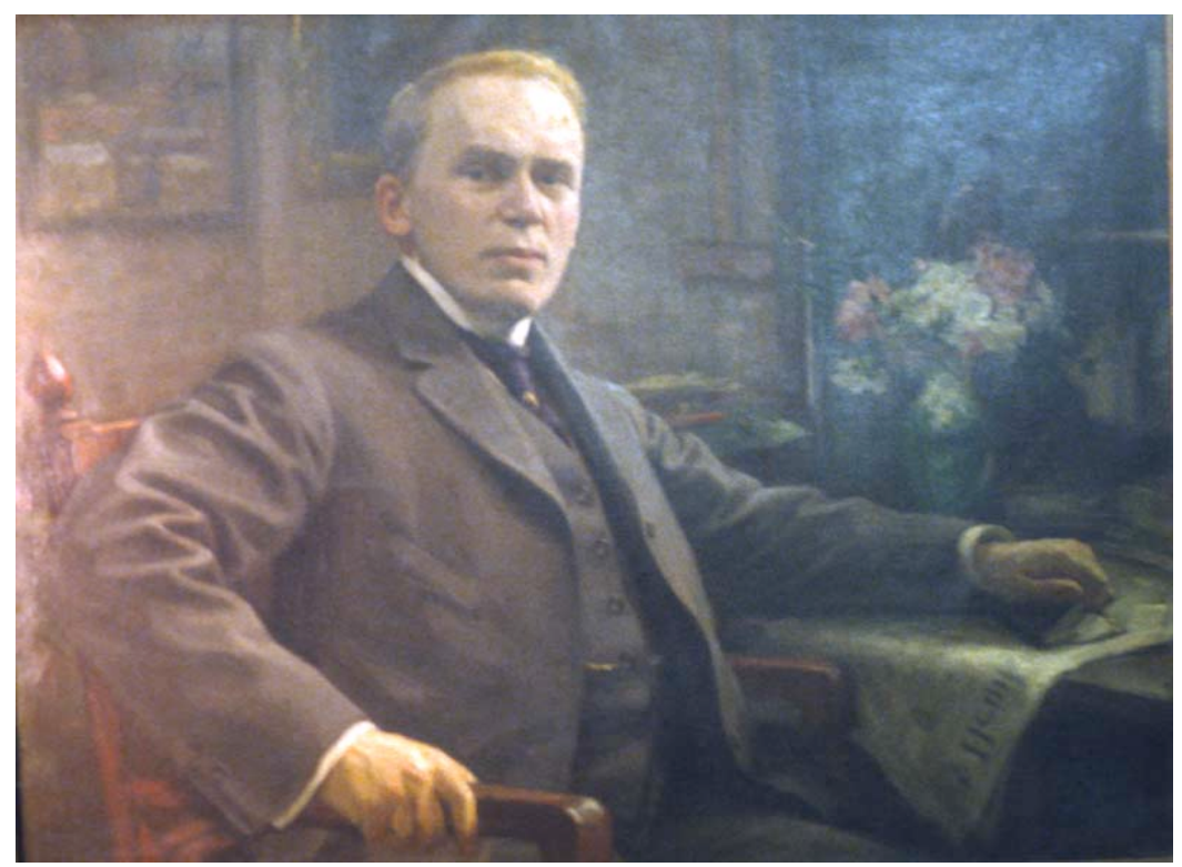
Fig. 3. Arvid Nyholm, Charles S. Peterson, 1913.