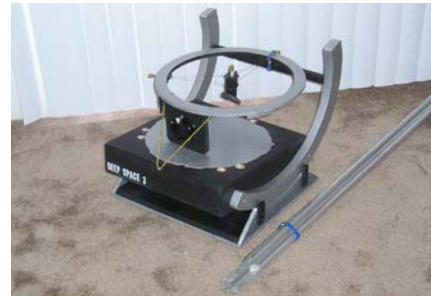
Deep Space 3 Telescope http://user.xmission.com/~alanne/DS3/DS3Main.html

Our design focuses on compactness and portability, allowing the users to easily store it in the back of a car and carry it to an observing location. It has an 8 inch mirror and a total focal length of 1200mm. The basic design is known as a truss tube assembly, where instead of a solid tube, the telescope's secondary mirror rests at the ends of four poles. This allows disassembly of the scope for transport. This is a popular design among amateurs, as shown by the image below, on the left. Once complete, our telescope will appear similar to this design, as demonstrated by the CAD Design on the right.