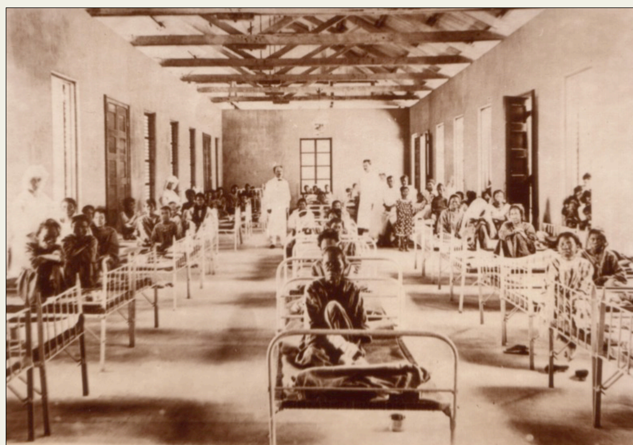
Figure 1. Leper's Ward, 1910 government report (Culion Sanitarium and General Hospital).