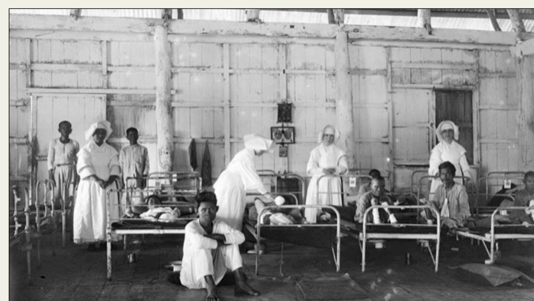
Figure 2. Nuns caring for patients in Leper's Ward (Culion Sanitarium and General Hospital).