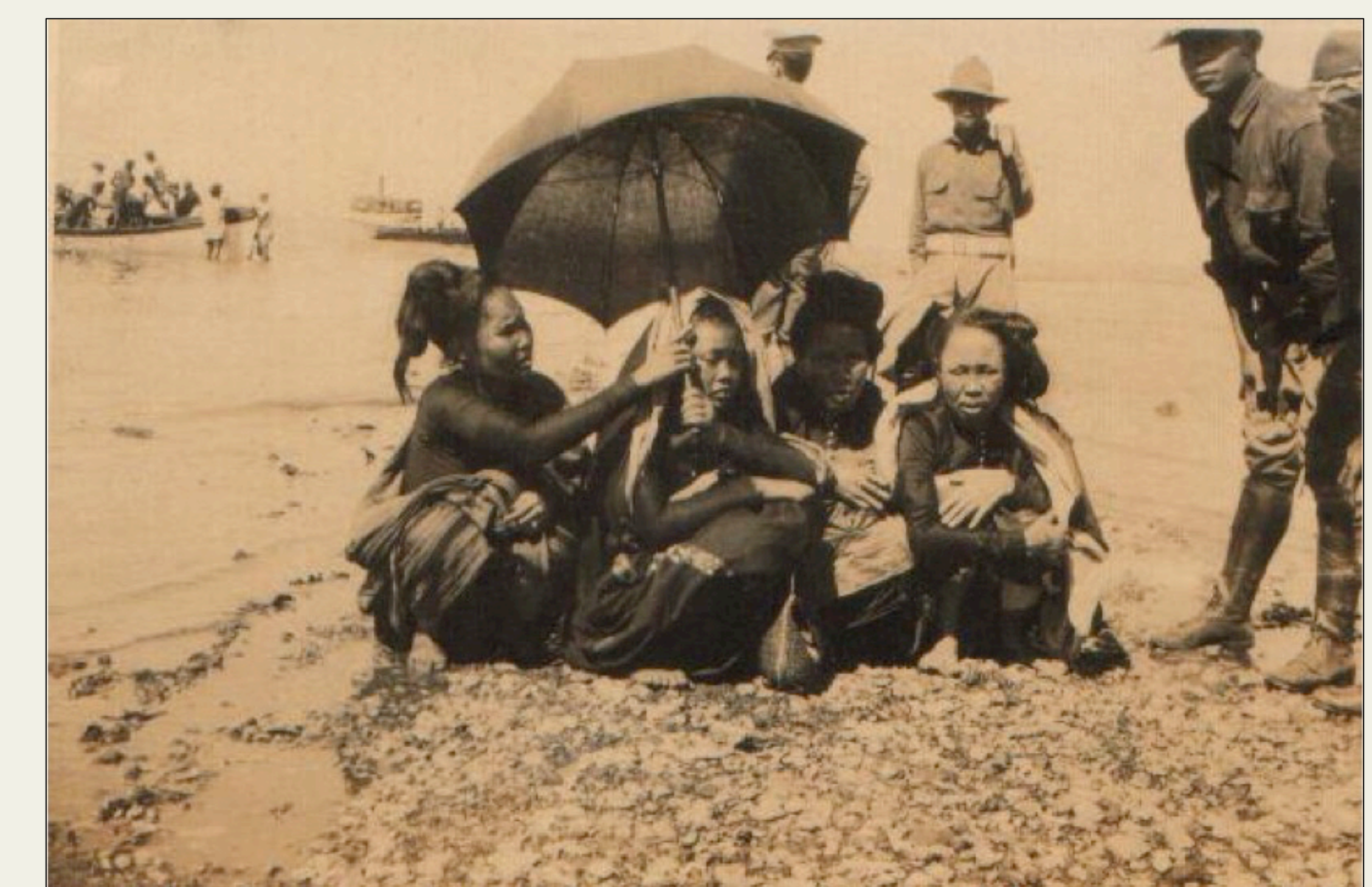
Figure 3. May 27, 1906- Arrival of lepers from Cebu (Culion Sanitarium and General Hospital)